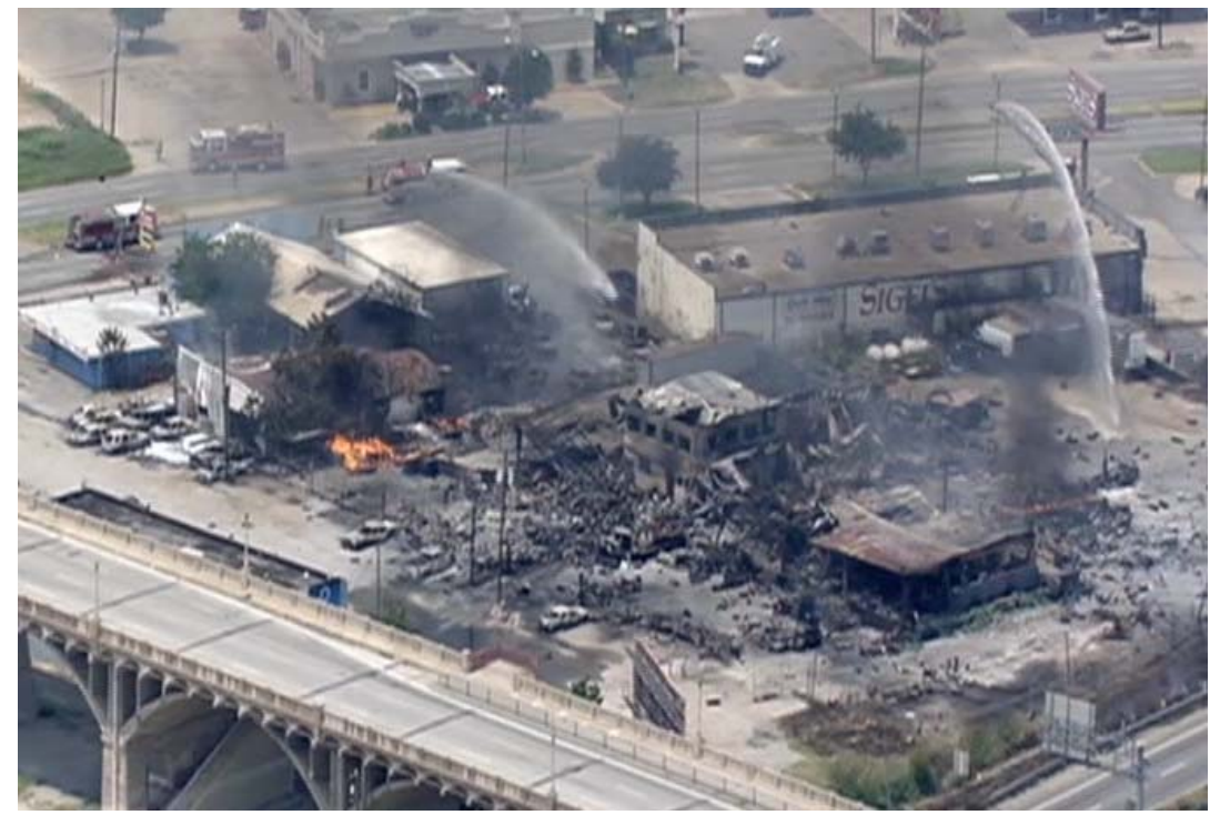
Figure 11. Final phase of fire suppression at Southwest facility in Dallas.