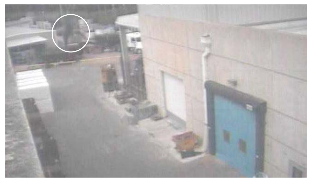
Figure 8. Security camera photograph of black plume coming from a cylinder on trailer in The Woodlands, Texas.

were standing on the ground at the back of the trailer near the trailer's block valve and attachment to the plant's discharge arm, but the focus of the camera was not adequate to show what they were doing. During postaccident interviews, both operators said that they had believed that they had completed the connection procedures and had pressurized the manifold. They told interviewers that after they had reviewed Western's standard operating procedures manual, however, they realized that they had not opened the block valve before pressurizing the manifold as Western's procedures required. Just after the accident, the trainee operator told a Hughes Christensen employee that the trailer had jumped as they opened the block valve. Shortly after that, the security camera recorded a black plume coming from one of the cylinders on the trailer. (See figure 8.) A similar reaction occurred on other cylinders on the trailer until the released gases ignited. Heat from the fire on the accident trailer caused the release of unreacted acetylene gas on an adjacent trailer.