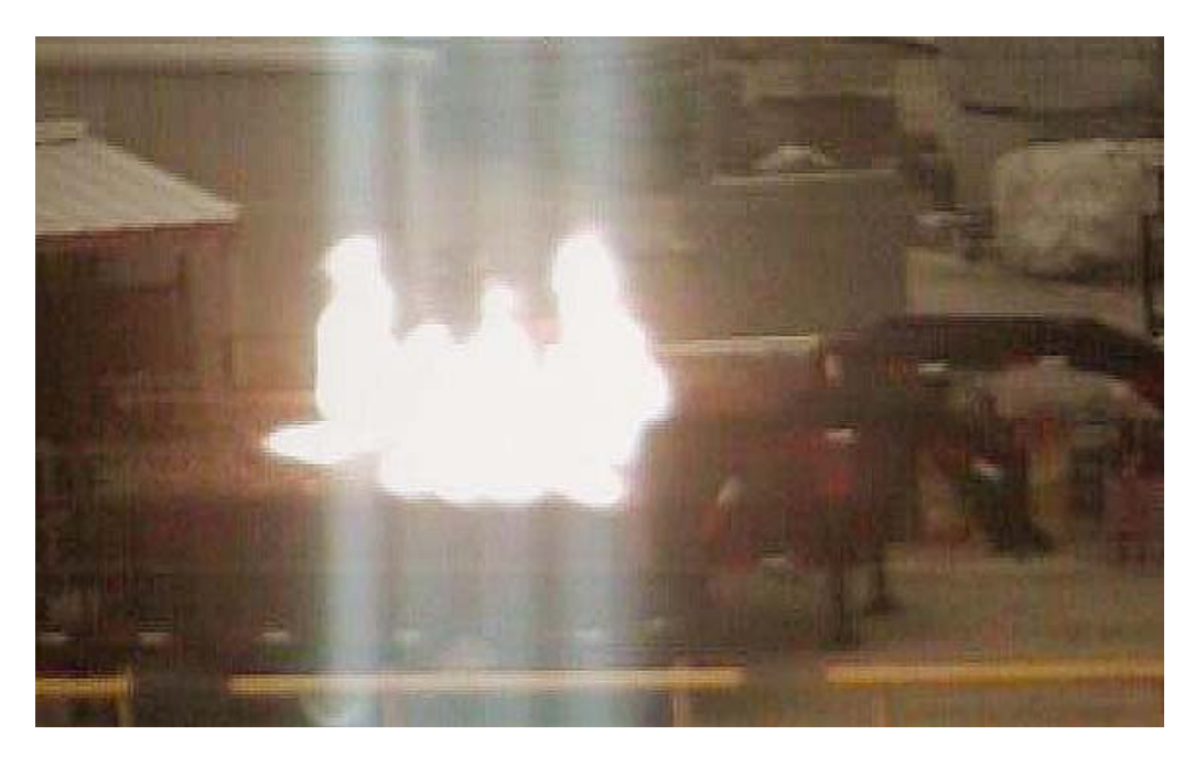
Figure 7. Security camera photograph of acetylene gas fire in The Woodlands, Texas.

About 2:55 p.m. on August 7, 2007, acetylene gas ignited on a Western mobile acetylene trailer containing 62 manifolded DOT 8AL specification cylinders (420 standard cubic feet capacity each) resulting in a fire on that trailer and an adjacent trailer at the Hughes Christensen plant in The Woodlands, Texas. (See figure 7.) The fire occurred as the operators were preparing the trailer to be unloaded. There were no injuries or fatalities. Property damage to the two trailers totaled $40,200.