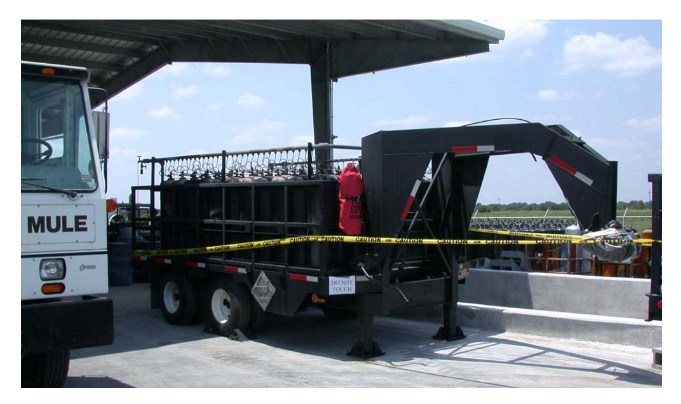
Figure 1. The Woodlands trailer (a small mobile acetylene trailer).

Figure 2 shows cylinders on a mobile acetylene trailer. The valve opening on each cylinder is connected by spiral tubing, called a pigtail, to the manifold that delivers or receives the acetylene gas to or from the cylinder. Attached to the manifold, on the back of the trailer, is a cargo transfer fitting, which is not visible in this photograph. This fitting is the connection between the trailer and the piping from the plant. The tubing and manifold piping are designed to contain the energy of an accidental decomposition reaction. A manual block valve (block valve) controls the flow of acetylene to and from the cargo transfer fitting. The piping includes an airactuated valve that shuts off the flow if a trailer pulls away accidentally before it is disconnected. A needle valve on the manifold is used to reduce pressure on the manifold after cargo transfer and leak testing. Pressure gauges are mounted on the trailer: one on the manifold and one on the trailer piping between the block valve and the connection to the plant piping. According to Western, filling the cylinders through the manifold connection takes about 12 hours.