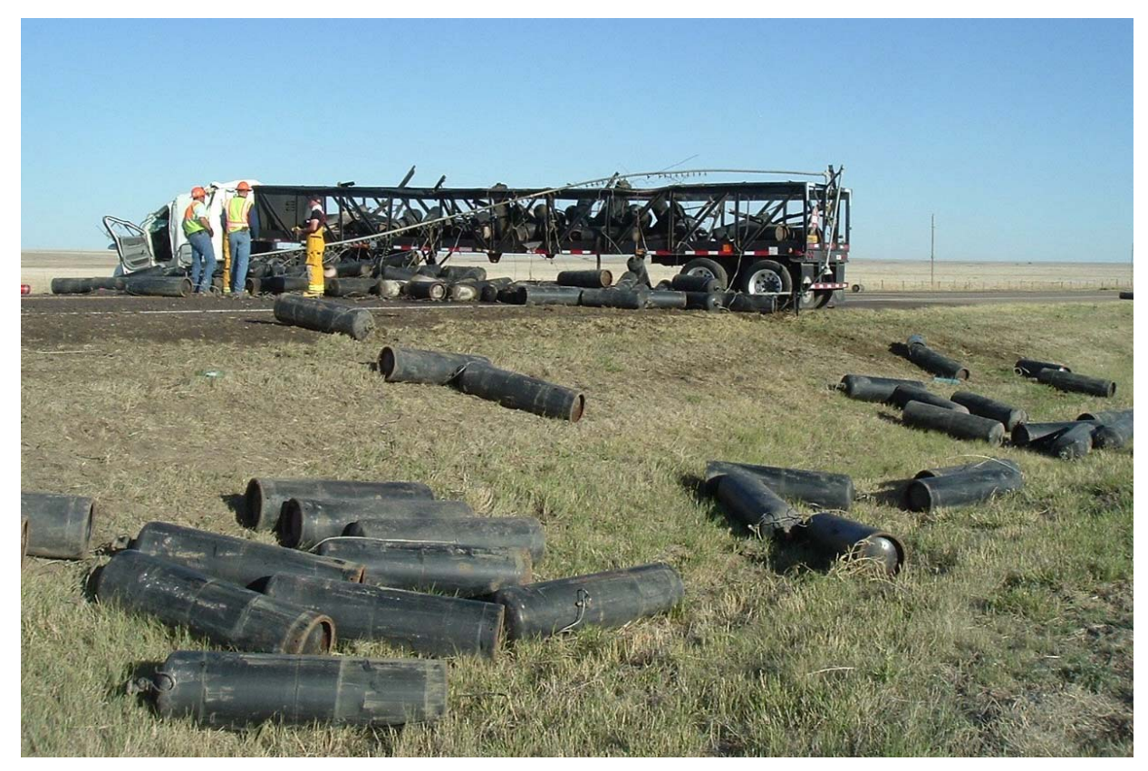
Figure 6. Lamar accident vehicle.

About 12:15 p.m. mountain daylight time on June 9, 2008, a southbound Western tractor and mobile acetylene trailer carrying 225 DOT 8AL specification cylinders (450 standard cubic feet capacity each) containing acetylene gas residue overturned on Highway 287 about 6.5 miles south of Lamar, Colorado.<sup>12</sup> As a result of the overturn, about half of the cylinders were thrown from the trailer, and acetylene gas from 86 of the 225 cylinders was released and ignited. (See figure 6.) The overturn damaged the tractor and the trailer. There was some fire damage on the trailer. There were no injuries from the accident. Property damage to the tractor and trailer totaled about $200,000.