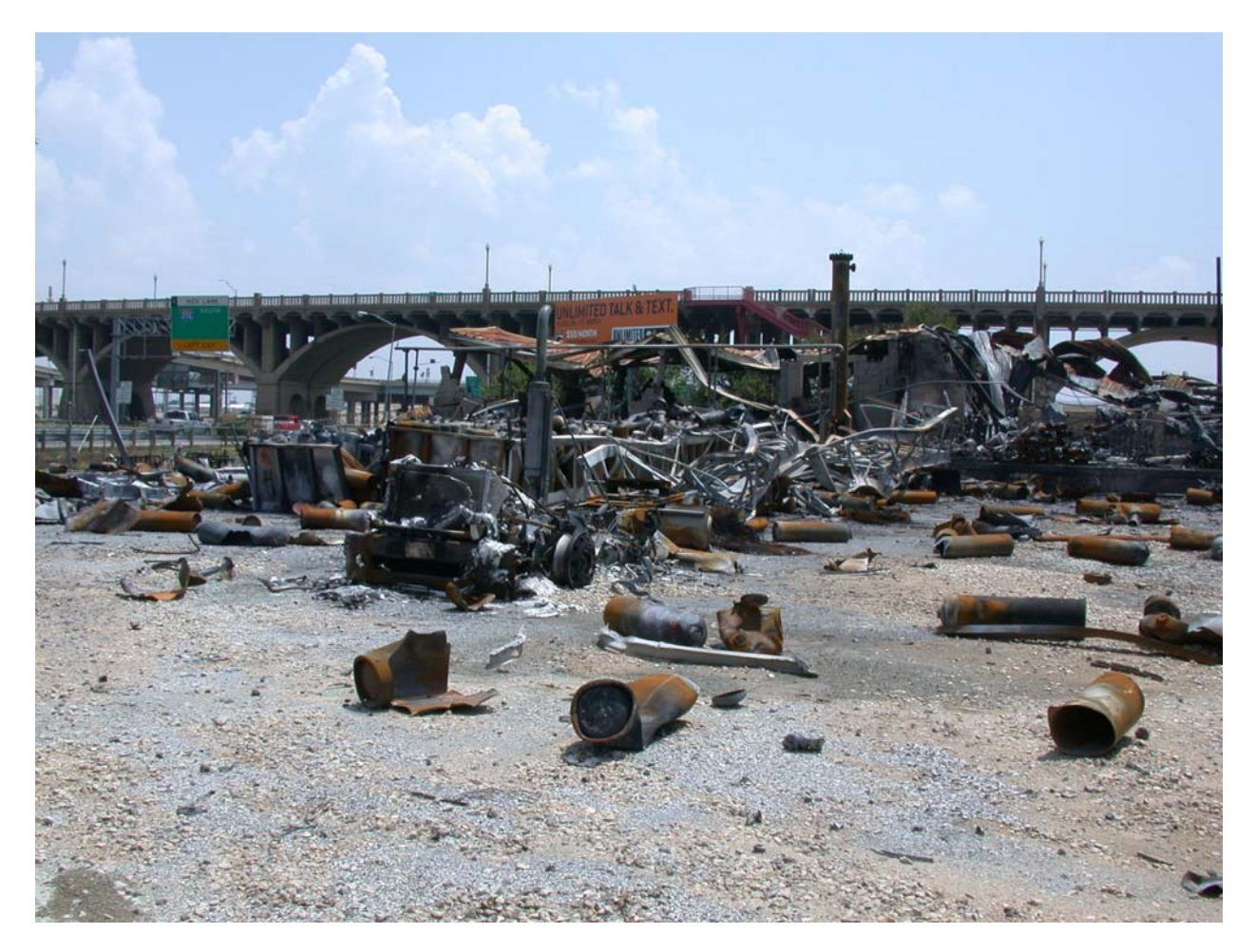
Figure 10. Dallas accident damage to Southwest facility and vehicles. (Accident trailer and cylinders in foreground.)

The accident trailer was filled and shipped from the BASF Corporation plant in Geismar, Louisiana. The capacity of the cylinders was approximately 100,000 standard cubic feet of acetylene. The operator typically worked in a two-person team that drove, loaded, and unloaded mobile acetylene trailers. The accident occurred during the operator's third delivery to Southwest, which was his first solo delivery to that location. He had made five solo deliveries to other facilities. The operator said that he had followed Western's standard operating procedures when he prepared the trailer for unloading at the Southwest facility. He said that after cycling the facility's discharge arm valve, leaving it closed (step 11 of Western's unloading procedures), he checked the pressure gauges on the manifold and both read 0 psig, which he did not identify as a problem. Step 4 of Western's unloading procedures requires that 50 psig of acetylene pressure remain in the manifold, and discussions with Western management revealed that at the completion of step 11 there should still have been slightly less than 50 psig pressure in the manifold.