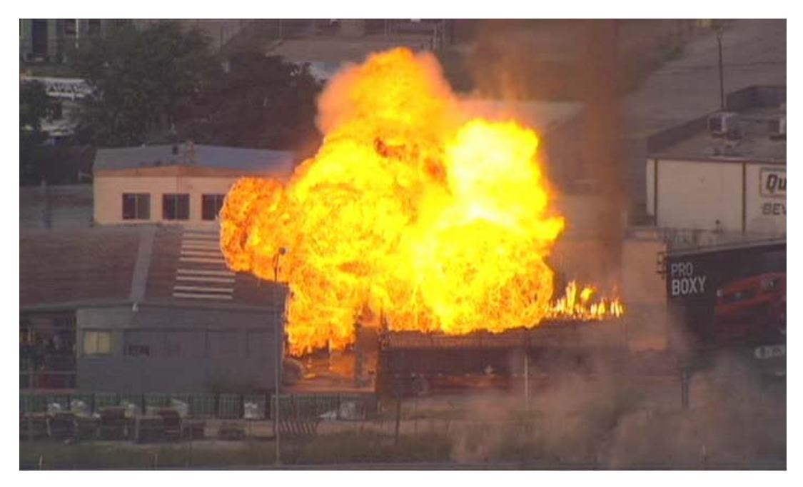
Figure 9. Acetylene gas fire at Southwest facility in Dallas.

About 9:50 a.m. on July 25, 2007, acetylene gas ignited on a Western mobile acetylene trailer containing 225 manifolded DOT 8AL specification cylinders (450 standard cubic feet capacity each) on the docks at the Southwest Industrial Gases (Southwest) facility in Dallas, Texas. (See figure 9.) The fire occurred as the operator was preparing the trailer to be unloaded. A video recording made by a Dallas television network did not record the initiation of this accident; however, it showed a gradual progression of the fire and explosions from the trailer on which the operator was working to adjacent trailers, to Southwest's building, and to vehicles parked in front, one of which contained acetylene-filled cylinders for delivery. The fire and explosions destroyed the Southwest facility and many vehicles, damaged several nearby buildings, and caused the failure of hundreds of acetylene-filled cylinders from three other Western acetylene trailers,<sup>13</sup> the delivery truck, and the facility's docks and storage. (See figure 10.) The operator sustained back injuries, and the plant manager and general manager were severely burned during the accident. There were no fatalities. Property damages have not been fully assessed, but Southwest estimated losses of more than $5 million.