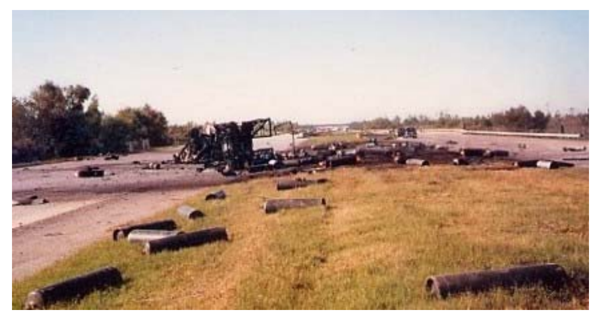
Figure 4. East New Orleans accident vehicle and cylinders.