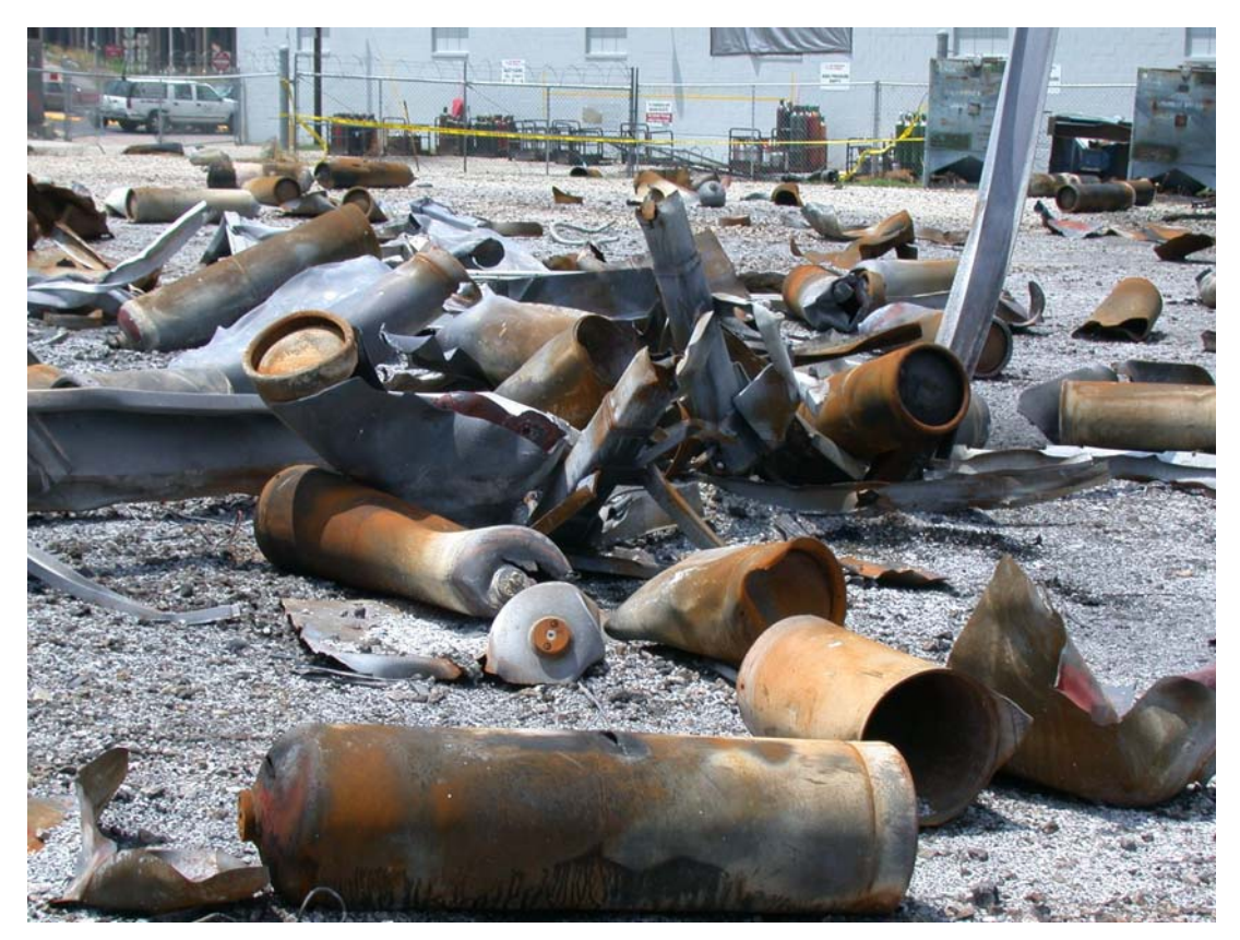
Figure 12. Dallas cylinder damage.