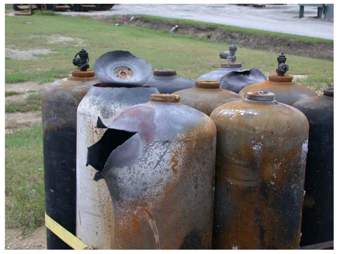
Figure 5. East New Orleans cylinder showing burst near head.