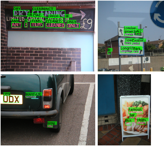
Fig. 3. End-to-end text localization and recognition results of proposed binarization method (without lexicon).