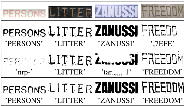
Fig. 1. A comparison of cropped image binarization results of methods with top OCR accuracy (labels flipped where appropriate). From top to bottom line: (1) original image, (2) Niblack, (3) Non-linear Niblack, (4) Proposed.