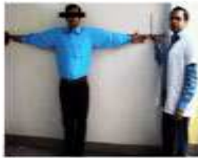
Photograph No. 3 (Arm Span)