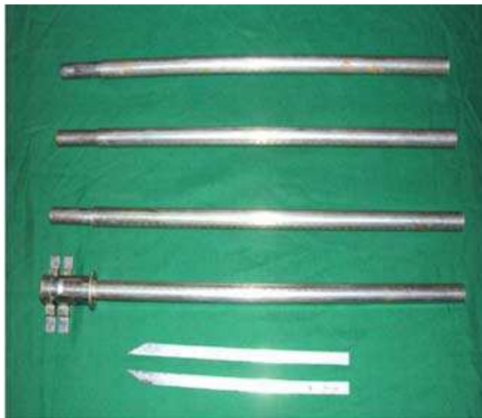
Photograph No.2 (Anthropometer Rod)