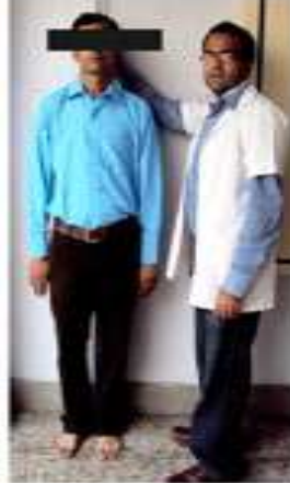
Photograph No. 4 (Stature)