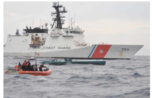
Eastern Pacific Ocean – A smallboat from CGC BERTHOLF approaches a self-propelled semi-submersible vessel suspected of smuggling 7.5 metric tons of cocaine.