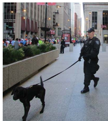
A Federal Protective Service inspector and his canine conduct bomb sweeps outside a Federal facility.

NPPD ensures that the assets, systems, and networks that enable the American way of life, including essential government services and economic activities, are sustained during steady-state and incidents that threaten the Nation's security. NPPD coordinates security and resilience efforts using trusted partnerships across the private and public sector and delivers training, technical assistance, and assessments to federal stakeholders, infrastructure owners and operators nationwide. NPPD provides the unifying framework for national infrastructure protection that presents a common understanding of risk and enables the necessary collaboration among diverse stakeholders. NPPD balances security concerns, business interests, and privacy in executing its mission. NPPD also safeguards important sensitive information provided by private sector business partners through its Protected Critical Infrastructure Information program, and thereby enables vulnerability information to be voluntarily submitted to the Department to inform its efforts to formulate security measures.