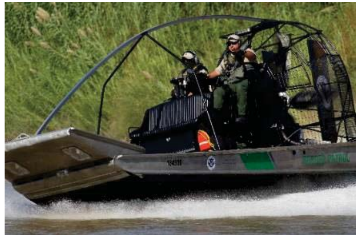
Border Patrol Agents conduct patrols in an Air-Boat along the Rio Grande in Laredo, TX.