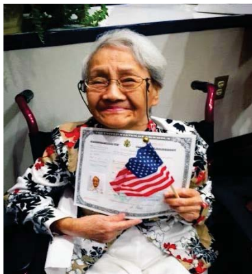
A new U.S. citizen, naturalized in Tampa, Florida on July 1, 2015.

USCIS provides information and decisions on citizenship and immigration benefit requests to customers in a timely, accurate, consistent, courteous, and professional manner, while also safeguarding our national security. USCIS processes more than 50 different types of citizenship and immigration benefit applications. Every case is unique and requires specialized attention from experienced USCIS immigration officers.