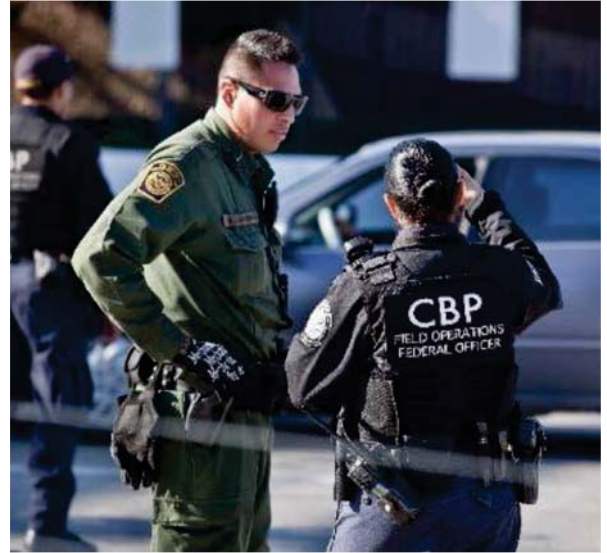
U.S. Customs and Border Protection agents and officers inspect incoming vehicles at the Calexico port of entry, California.

Equally important to promoting national and border security, CBP enhances America's economic competitiveness by enabling lawful trade and travel at the nation's 328 ports of entry. Efficiently and effectively processing goods and people across U.S. borders is crucial to support the U.S. economy, promote job growth, and help the private sector remain globally competitive, today and in the future. As international trade and travel increase, CBP must increase its capacity to facilitate and secure cross-border activity through better training and enabling technologies, thereby allowing the U.S. economy to grow. Through workload staffing models, CBP is advancing its ability to identify needs and requirements at ports of entry that will enable and facilitate cross-border trade and travel.