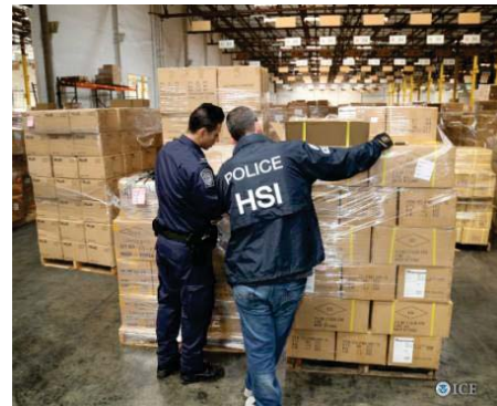
ICE HSI special agents work to stop counterfeit goods and products from being smuggled into the United States