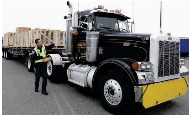
A CBP Officer inspects a truck using hand-held Non-Intrusive Inspections (NII) Equipment at a port of entry in Seattle, WA.