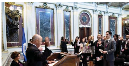
Deputy Secretary of Homeland Security Alejandro Mayorkas delivers remarks and gives the Oath of Allegiance at a Naturalization Ceremony.