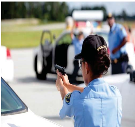
Basic training students participate in transitional traffic stop training.

As the Nation's primary provider of law enforcement training, FLETC is responsible for offering an efficient training model that delivers the highest quality training possible for those who protect the homeland.