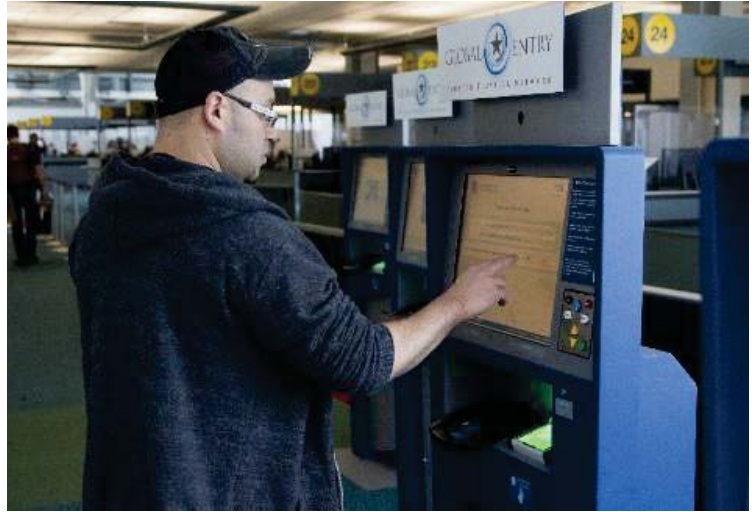
CBP preclearance operations at Vancouver International Airport, Canada. Passengers wait time in processing is limited through the use of kiosk programs such as Global Entry and NEXUS.