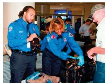
Transportation Security Officers check passenger's carry-on baggage.

Transportation Security Officer Workforce: This request funds an increase in the TSO workforce as part of a comprehensive response to the deficiencies uncovered by the OIG covert testing. In light of the results of this covert testing, TSA has renewed its focus on the fundamentals of security by striking an improved balance between security effectiveness and speed in screening operations. In addition, passenger volume has been growing faster than previously predicted – overall passenger growth is increasing at an even faster pace than the increased enrollment in TSA Pre✓ ® . The increase in the size of the TSO workforce will allow TSA to improve our screening performance at the checkpoint, while continuing to facilitate reasonable wait times even with the increase in air travel.