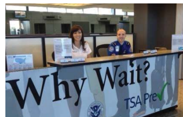
TSA Pre✓® enrollment center.