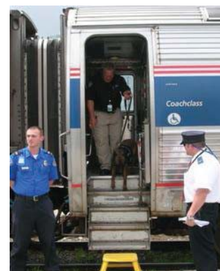
VIPR team inspects a passenger rail car.