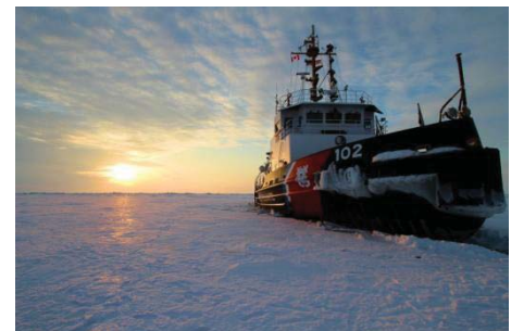
Lake Erie – CGC BRISTOL BAY breaking ice to facilitate commerce in Lake Erie.