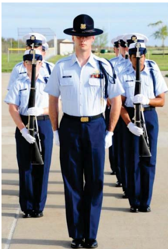
Cape May, New Jersey – Members of Coast Guard Training Center Cape May color guard perform during a community festival.

The Coast Guard is an adaptable, responsive, military force of maritime professionals whose legal authorities, capable assets, geographic diversity, and expansive partnerships provide a persistent presence in our Nation's inland waters, ports, coastal regions, and offshore areas of operations. The Coast Guard leads responses to maritime disasters and threats, promotes a safe and secure maritime transportation system, works to prevent maritime incidents and potential acts of terrorism, and rescues those in distress. The Coast Guard regulates hazardous cargo transportation, holding responsible parties accountable for environmental damage and cleanup, protecting living marine and natural resources. The Coast Guard enforces laws and treaties and guards against illegal activity in the maritime domain.