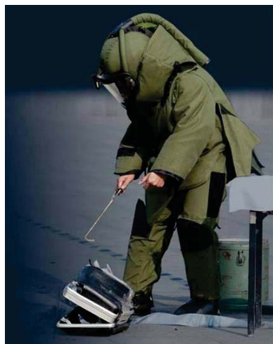
CBRNE Office trained bomb technician clears suspicious object.

The CBRNE Office focuses DHS efforts to prepare the Nation for those threats and hazards that pose the greatest risk to the security of the Nation – including pandemic and infectious disease and chemical, biological, radiological, nuclear, and explosives threats. The Office integrates the policy, planning, analysis, coordination, research and development, and capacity building functions of the Department in order to better support the needs of DHS front-line employees, other Federal departments and agencies, and state, local, and private sector partners who are critical to the all-of-Nation approach to homeland security. The CBRNE Office is responsible for understanding and anticipating CBRNE threats and advancing materiel and non-materiel solutions to enhance national CBRNE preparedness against these threats. Persistent stakeholder engagement ensures transition and integration of capability by appropriate organizations at all levels.