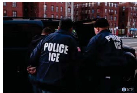
ICE officers arrest convicted criminal aliens and fugitives in an enforcement operation throughout all 50 states.