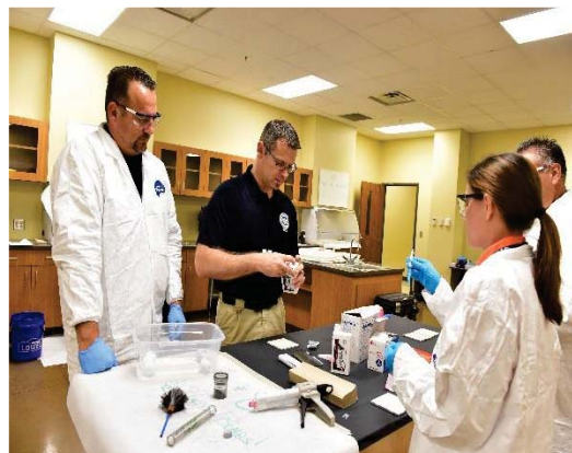
Advanced students receive instruction on forensic latent print development.

FLETC trains those who protect the homeland. FLETC's federally accredited law enforcement training programs constitute a source of career-long training for the worldwide law enforcement