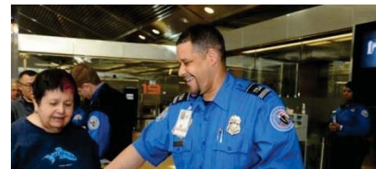
A Transportation Security Officer verifies a passenger's travel documents.