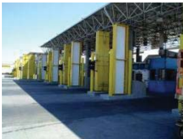
Radiation detection systems protecting US borders.

The Office protects the Nation from CBRNE terrorism. It does so by developing, acquiring, and deploying detection technologies; supporting operational law enforcement, including the health and wellness of DHS workforce; protecting the Nation against chemical and biological health impacts from both terrorist and naturally occurring events; integrating technical nuclear forensics programs and advancing the state-of-the-art in nuclear forensics technologies; and by enhancing capabilities of public and private sector partners to prevent, protect against, respond to, and mitigate explosives-related threats. The office provides guidance for first