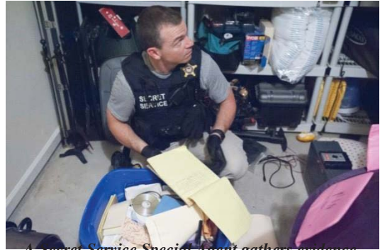
A Secret Service Special Agent gathers evidence in an investigation into stock market hacking.