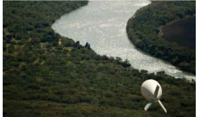
A CBP Tethered Aerostat Radar System stands high above the Rio Grande near McAllen, Texas, offering the ability to see across the border into Mexico and anticipate illegal crossings.