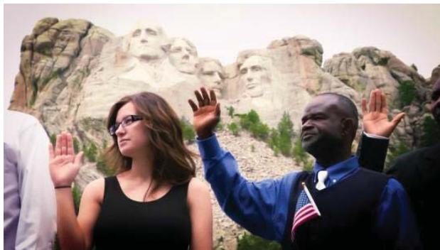
A Naturalization Ceremony was conducted at the Mt. Rushmore National Memorial in South Dakota on June 11, 2014.

USCIS ensures that immigration benefits are granted only to eligible applicants and petitioners. Its anti-fraud efforts make it easier for employers to comply with labor and immigration law and harder for those seeking to exploit our systems. Additionally, USCIS facilitates the apprehension of criminals across the country through security checks on persons seeking citizenship and immigration benefits.