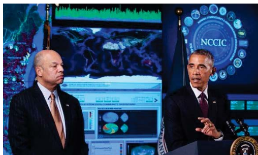
President Obama delivers remarks at the National Cybersecurity and Communications Integration Center (NCCIC).

NPPD's programs and activities ensure the timely sharing of information, analysis, and assessments that provide the situational awareness necessary to build resilience and mitigate risk from cyber and physical threats to infrastructure. Through established partnerships, NPPD leads the national unity of effort for infrastructure protection and builds infrastructure security and resilience by delivering security related technical assistance, training, analysis, and assessments to infrastructure owners and operators nationwide. NPPD also executes law enforcement authorities to protect Federal facilities, and those who work in and visit them, against physical and cyber threats.