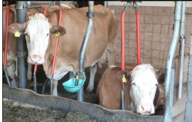
In tie-stalls cows are tethered in one place by a chain (top), rope or stanchion (bottom). Food and water is brought to them. Cows are only able to stand or lie down; in stanchion systems they cannot even scratch their backs.