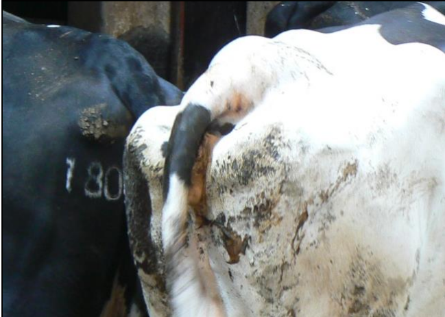
Docking of tails in the EU is illegal but is still practised in some member states and in other countries around the world.

- Tail docking: Some farmers dock the tails of calves at about 10 days old based on the disproven belief that it is more hygienic for the cow, and for the farmer during milking. This is done either by hot iron, crushing or tying a rubber band around the tail which stops the blood flow so it eventually falls off.