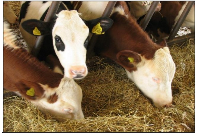
In the EU, calves must be group housed after 8 weeks old because social contact is important for their welfare.

- Following weaning, calves can be vaccinated against certain bacterial or viral diseases and be given treatment for parasites. Vaccination usually requires a course of injections.