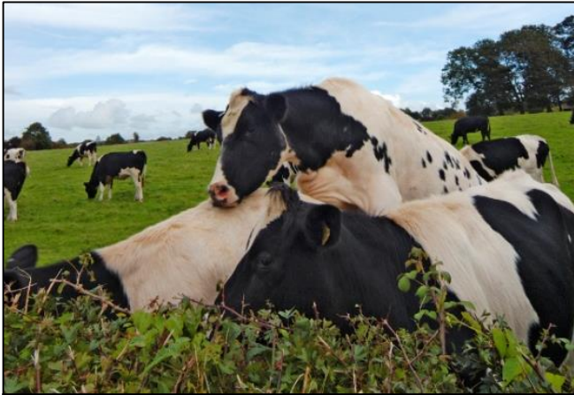
Mounting behaviour is typical of a cow in heat.

When a cow is 'in heat' ( receptive to mating ), she will typically become more active and spend more time licking, sniffing another cow's vulva and attempting to mount other cows. A cow on heat will mount others regardless of whether they are themselves in heat, but if they stand to be mounted it is likely that they are also in heat.