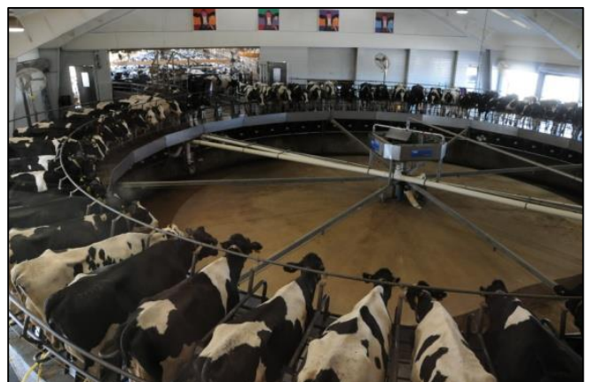
A rotary milking parlour is commonly used in larger herds.

There are many different milking parlour designs including traditional herringbone and parallel parlours, and modern rotary parlours which are used to milk large herds, sometimes with automatic milking machines.