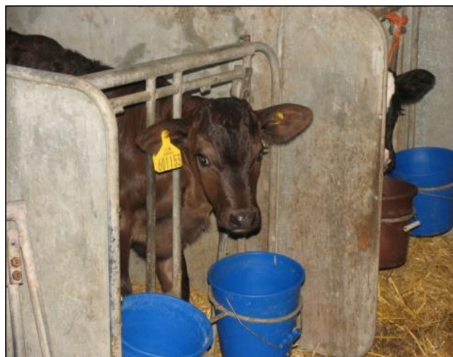
In the EU, calves may be kept in single pens for the first 8 weeks of life.

The cow has a strong maternal instinct and is normally distressed by the removal of her calf. Both the calf and mother will make loud calls trying to locate each other after they are separated.