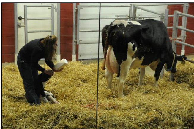
In some systems the calf will never suckle and instead the mother is milked for colostrum by the farmer and this is fed to the calf from a bottle, nipple feeder or bucket.