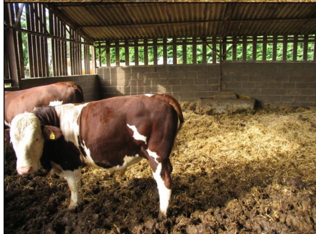
Loose housing - straw bedding area in a barn (can be just bare earth). Cows about to give birth are also housed in straw yards (top). Bulls on dairy farms are also often housed in loose housing when they are not running with the herd (bottom).