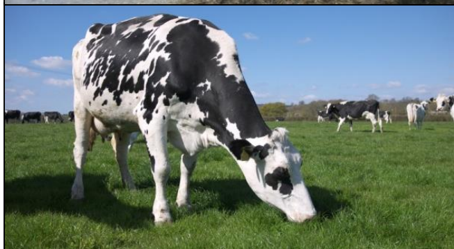
Top: cows eating TMR, which is a balanced diet to help provide the energy needed for medium to high yielding cows. Bottom: cows at pasture; a diet of grass can only provide enough energy to produce around 4,000 litres of milk a year.

- Cows may be fed TMR throughout the year; it may make up the whole diet (more often early in the lactation when the yield and energy demand is high) or be given in addition to grass at pasture. As the cow requires more TMR to produce high yields of milk , there is a trend in the industry for cows staying indoors for longer