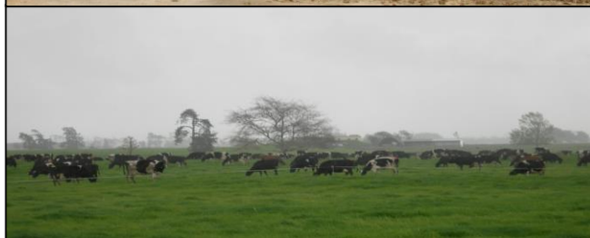
Outdoor access does not necessarily mean cows are kept on grass: A Californian farm with cubicles outside under shelter and acres of barren land (top); In New Zealand cows live on pasture all year around, normally without any shelter from bad weather or the sun