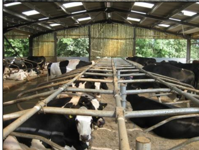
Cubicle design varies and bedding materials include: sand, straw, peat and mattresses. Sand is preferred by the cow. Waterbeds can also be used.