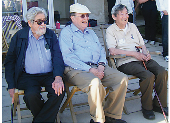
Figure 9. Kuranishi with J. J. Kohn and L. Nirenberg at a conference in Prague on Several Complex Variables.

Joseph J. Kohn is a professor emeritus of mathematics at Princeton University. His email address is kohn@math.princeton.edu.