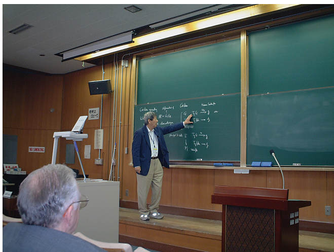
Figure 1. Kuranishi lecturing at the Oka100 conference in Kyoto-Nara, 2010.

Professor Masatake Kuranishi passed away on June 22, 2021. He was one of the truly great mathematicians of the twentieth century, whose legacy permeates whole areas of current mathematics. This memorial article is a tribute to him, with contributions from many of his former students, friends, and colleagues.