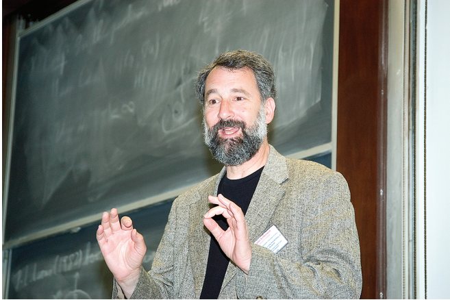
Figure 6. Charles Fefferman lecturing at the 2005 Columbia Conference in honor of Kuranishi.

singularities not present in the hoped-for embedding. If the embedding existed, he could use it to prove his weighted estimates. If the estimates held, he could use them to correct an approximate embedding and produce a better approximate embedding. To avoid circular reasoning, the whole process was wrapped inside a Nash-Moser iteration. My first reaction was that Kuranishi was taking a huge gamble. Why introduce extra singularities, hoping eventually to get rid of them? My heart sank as I discovered a fatal error in Kuranishi's proof. Indeed, I thought, the plan was doomed.