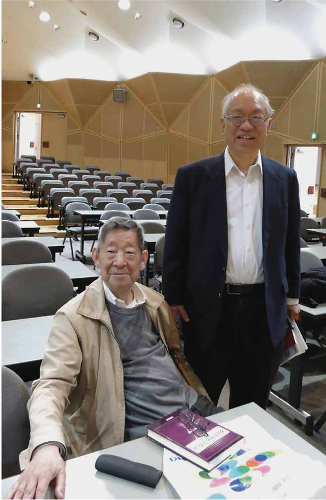
Figure 16. Kuranishi and S.-T. Yau.

positive sectional curvature. This took me by surprise. The paper was over 150 pages. Despite it being full of original ideas, it fell through eventually. But he treated the whole process in the most graceful way, and I am grateful for it.