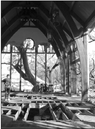
Looking east in the nave at Trinity Pass Christian.