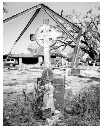
The Celtic cross and historic marker were left standing at the front entrance to Church of the Redeemer. In the background is the twisted iron frame of the church.