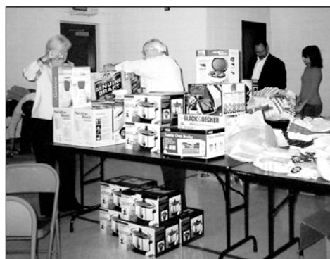
Unpacking supplies from Fort Worth in the parish hall at Church of the Redeemer, Biloxi.

We are thankful to those who sent us, for hearts that are so mission-minded and so generous, all in the name of an awesome God.