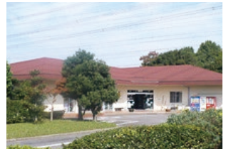
Chita Electric Power Museum