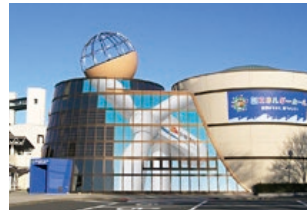
Renewable Energy Hall