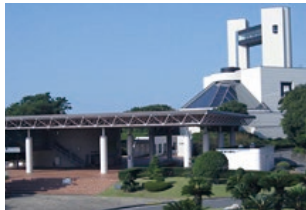
Hamaoka Nuclear Power Station Exhibition Center