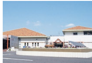
Hekinantantopia Electricity Museum