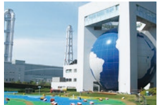
Kawagoe Electric Power Museum Tera 46