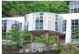
Ikawa Electric Museum