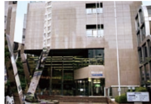
The Electricity Museum

The Electricity Museum is located on the site where the first power station in the Chubu region was situated. On the exterior of the building there is a plaque that reads "Birthplace of the electricity business in the Chubu region."