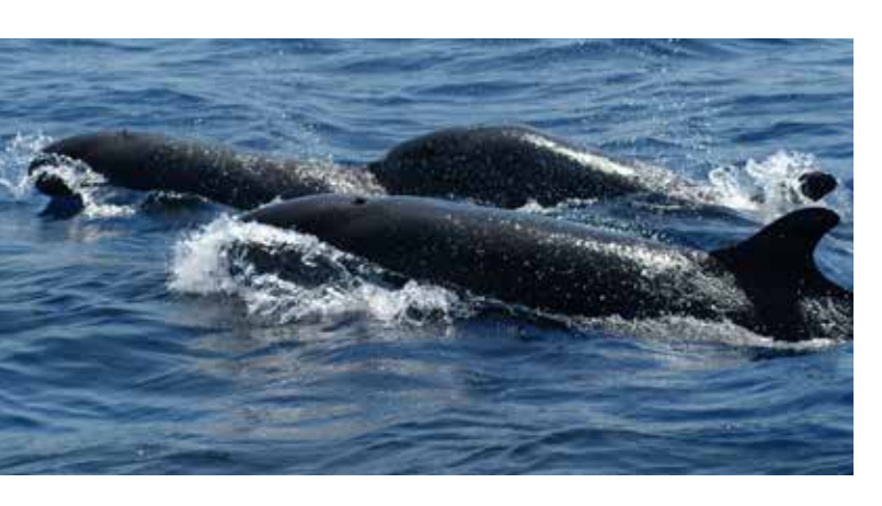
False killer whales.

The diversity and distribution of marine mammals have been assessed around Mayotte (Kiszka et al. 2007a, 2007b, 2010b). The variety of available marine habitats around the island, in close proximity to one another, may well explain