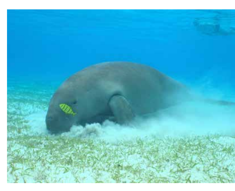
Dugong – probably the most endangered and threatened marine mammal in the SWIO.

These areas may be considered as hotspots, as they are critical habitat for at least two of the three most vulnerable marine mammal species in the SWIO. It is clear that other areas are also potentially important for these species (for example off Kenya), but need to be further identified in the future, through regional collaboration and the implementation of a regional research project on the status and distribution of the most endangered marine mammals in the SWIO. In the future, a clear priority should be given to the study and management of these three species. For management purposes, stock boundaries should be further investigated (in the frame of this new potential initiative), as management of marine mammal populations is clearly a transboundary issue. Of significance for SWIOFP is the recognition that fisheries development in these sensitive areas needs to be carefully monitored and controlled, and in many cases restricted.