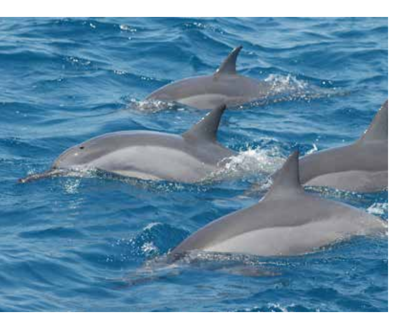
Spinner dolphins.

Bycatch records of marine mammals in the pelagic longline fishery have been anecdotally reported. Around the island of Mayotte (NE Mozambique Channel), there is evidence of interaction between oceanic delphinids and the longline fishery, especially short-finned pilot whales, as non-lethal injuries on the dorsal fin have been observed on several individuals (Kiszka et al. 2008b). Between 2009 and 2010, an observer programme in the longline fishery around Mayotte recorded only one marine mammal (false killer whale) bycatch in the pelagic longline fishery. The animal was released alive (Kiszka et al. 2010c). Another bycatch has been mentioned from the longline fishery off La Réunion, involving a Risso's dolphin (Poisson et al. 2001).