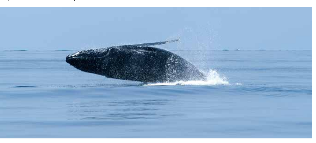
Humpback whale.

Along the east coast of South Africa, most delphinid information collected relates to Indo-Pacific bottlenose ( Tursiops aduncus ) and Indian Ocean humpback dolphins