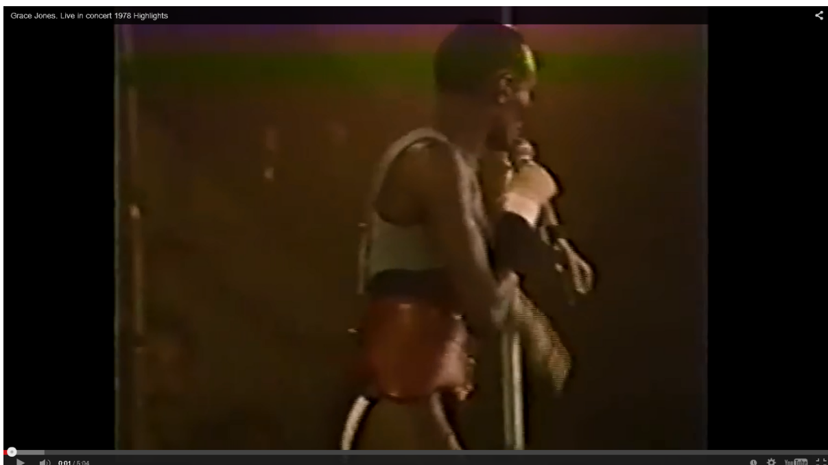
Fig. 4: Grace Jones dressed in boxing gear during her performance at the Roseland dance space. "Grace Jones. Live in concert 1978 Highlights", YouTube video, 3:38. Posted by "Lee Lee", 30th July 2011.