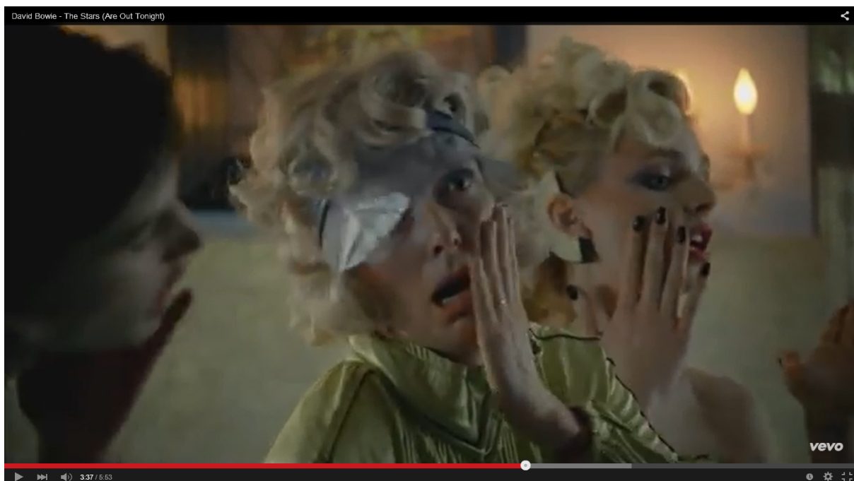
Fig. 6: Tilda Swinton and Andreja Pejić in David Bowie's video for "The Stars (Are Out Tonight)".

"Grace Jones - I'm Not Perfect But I'm Perfect For You", YouTube video, 3:52. Posted by "József Csáth", 24th September 2014. Author's screenshot.