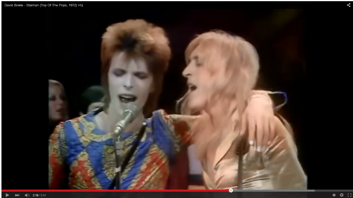
Fig. 1: David Bowie slinging his arm around guitarist Mick Ronson. “David Bowie - Starman (Top Of The Pops, 1972)”, YouTube video, 3:31. Posted by “The Doors”, 23rd February 2010.