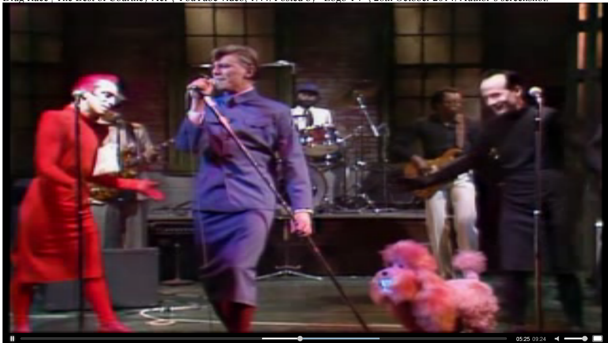
Fig. 3: David Bowie performing in the skirt suit on Saturday Night Live, with Joey Arias and Klaus Nomi. Disclose.tv. "BOWIE - RARE LIVE VIDEO - MAN WHO SOLD THE WORLD +2 - SAT NIGHT LIVE 1979," online video, 9:24. Posted by "Butlinca", 12th October 2012. Author's screenshot.