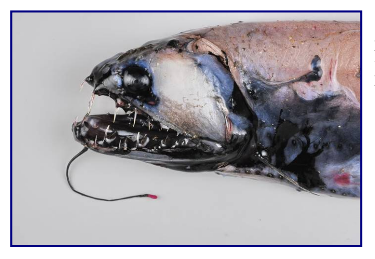
Fig. 7. Stareater showing the sharp curved teeth and red luminous lure