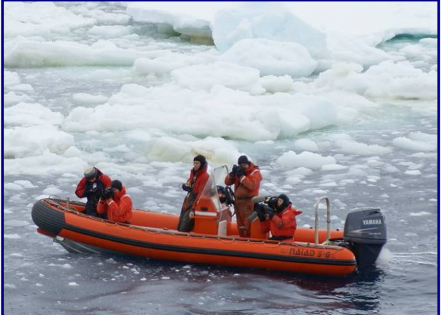
Fig. 4. The documentary team filming Tangaroa , working in heavy ice.