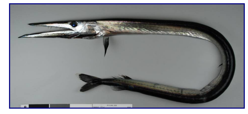
Fig. 6. Daggertooth set up for specimen photography

The stareater is another midwater predator. Smaller and more fragile than the daggerfish it is believed to capture its prey by luring small fishes into striking range with its red luminous chin barbel. The delicate fins and skin on this specimen were abraded by the net, but all important key features remained. These include the row of light organs along the belly (seen as black dots on Fig. 7); the mouth with its long, slender, curved teeth; and the lure. This 21 cm long specimen is about as big as this species gets. Scientists are unsure as to exactly how many species of stareater there are.