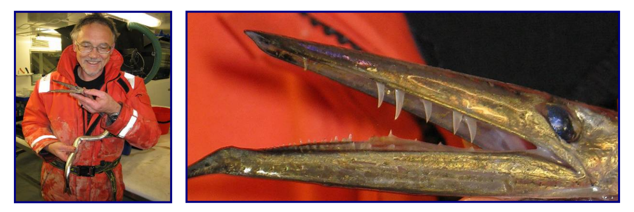
Fig. 5. Andrew Stewart holding a freshly caught daggertooth and close-up of its jaw

At 71°S, the half-grown, 50 cm long daggertooth specimen (Fig. 5 & 6) is one of the southernmost daggertooth specimens ever caught. The unusual forward-curved teeth in the upper jaw of this species help it to immobilise its prey. When the daggertooth clamps down on its prey (usually small fish) it then pulls backwards and the teeth cut deep into its victim, often severing the spine and paralysing it. Because this specimen is in such good condition, we were able to record not only the iridescent body colour, but also the brilliant sapphire blue of the eye. Sadly, these colours fade rapidly on death and are not visible in museum collections.