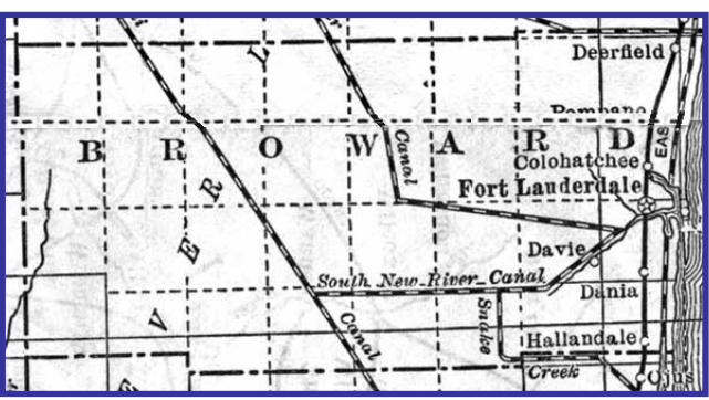
U.S. Railroad Administration Map, 1920

The 1920 Census divided Broward into six precincts (precursors to census tracts), which included incorporated and unincorporated areas. Fort Lauderdale was the most populous precinct.