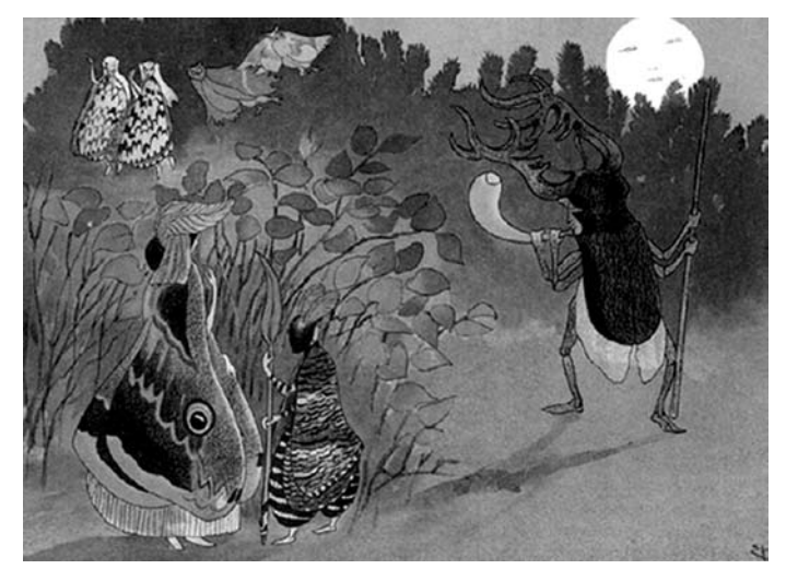
Figure 4. — Ernst Kreidolf, Sommervögel. Mondnacht, 1908. Kunstmuseum, Bern.

The beetle can also be seen in the children's story "Sommervögel" by Ernst Kreidolf. Once at a track event standing with other beetles in front of a grandstand full of butterflies with human faces and once with real deer antler playing a horn in the company of two moth fairies while passing through a moon flooded forest on a summer night (Fig. 4). In the story "The Butterfly Ball and the Grasshopper's Feast", the English illustrator Alan Aldridge depicts a stag beetle playing in a band, assisting a kingfisher with the fishing net or as a battle horse ridden by an ant in shining armour.