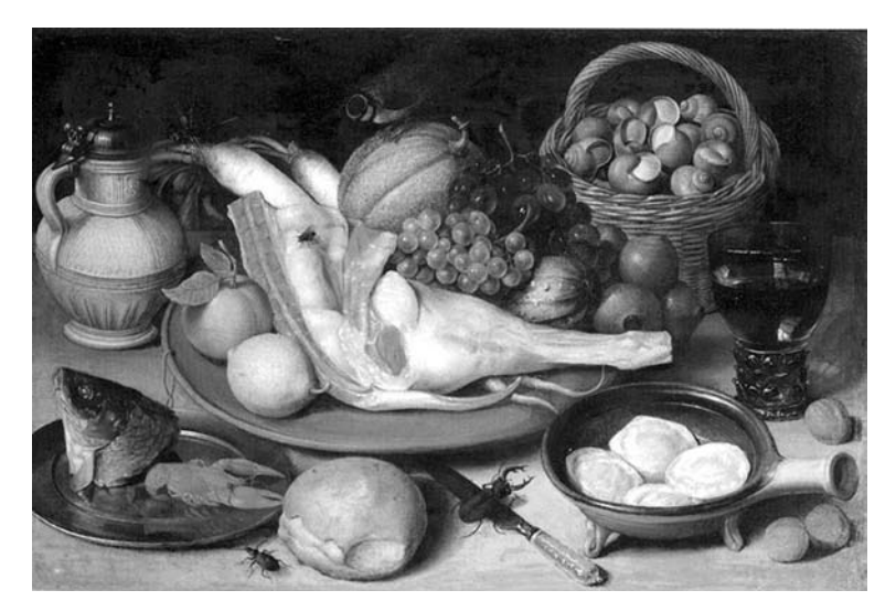
Figure 2. — Georg Flegel, Esswaren mit Käfern und Meise, 16th/17th century. Öffentliche Kunstsammlung Kunstmuseum, Basel.

About the same time, Otto Marseus van Schrieck dedicated a splendid and romantic painting to the stag beetle, on which a male and female Lucanus cervus are flying around a hazel shrub. In a further painting he portrays the beetle fighting with a wasp next to a bird's nest.