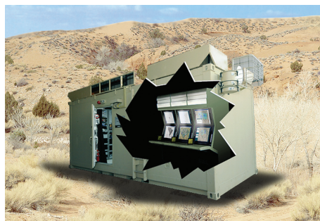
Battle Management & Control