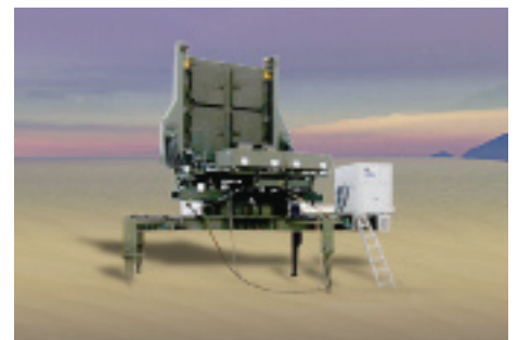
Detection & Tracking Radar