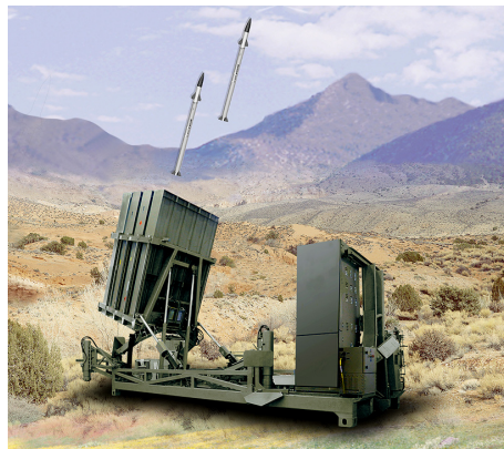
Missile Firing Unit

The Iron Dome system has been selected by the Israeli Defense Ministry as the best system offering the most comprehensive defense solution against a wide range of threats in a relatively short development cycle and at low cost.