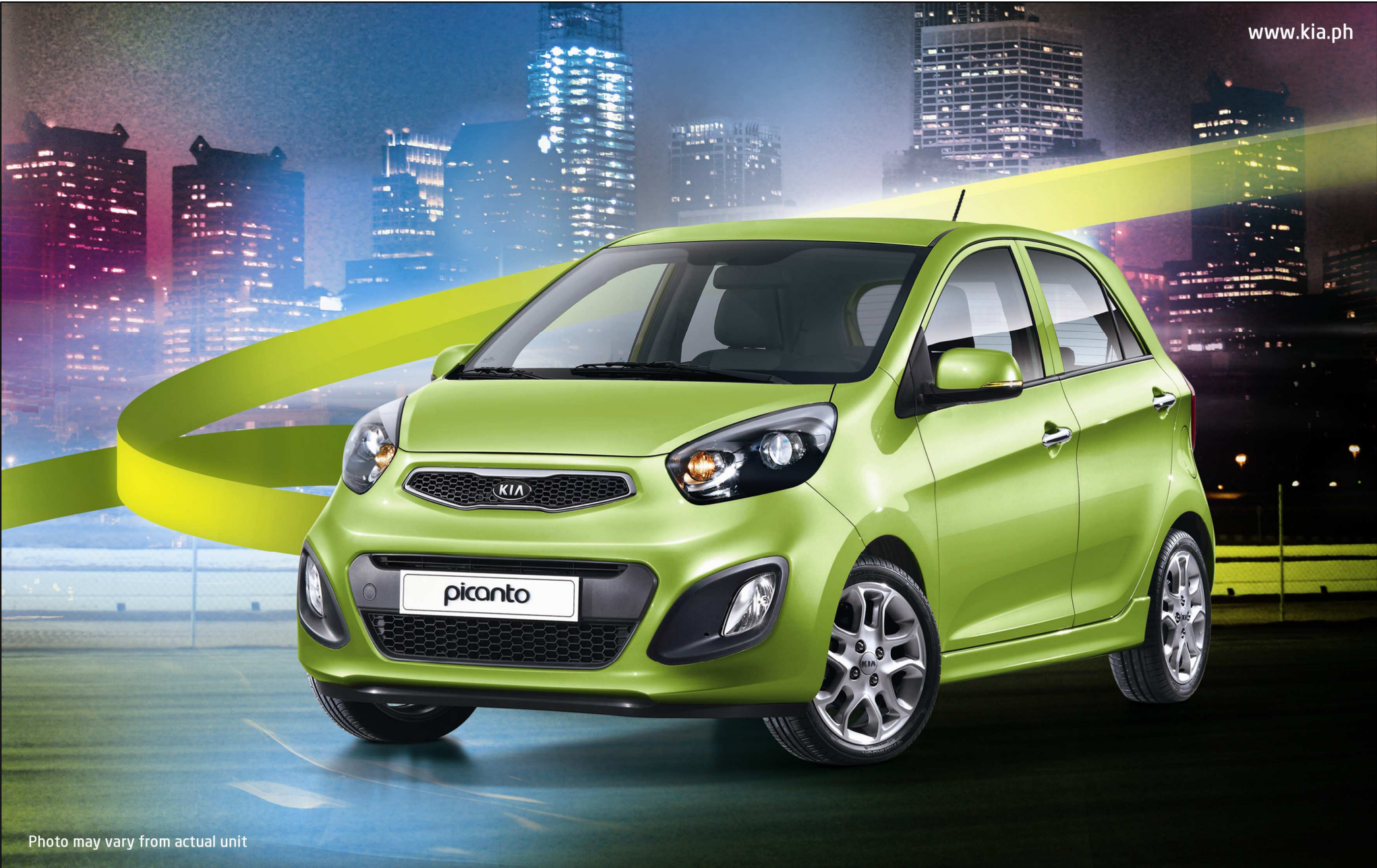
Photo may vary from actual unit