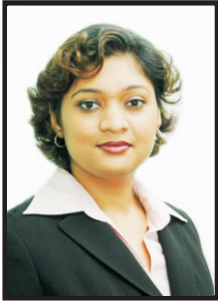
Priya Devi Manickchand

Minister of Human Services and Social Security