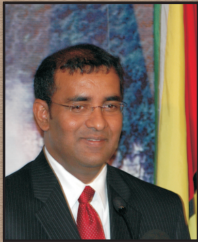
H.E Bharrat Jagdeo Chairman of the Cabinet

Mr. Bharrat Jagdeo became President of the Co-operative Republic of Guyana on August 11, 1999. Until then, he was the Minister of Finance.