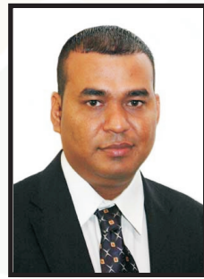
Robert Montgomery Persaud

From 1994 to 2001, he served as Chancellor of the University of Guyana following which he assumed the position of Minister of Foreign Affairs.