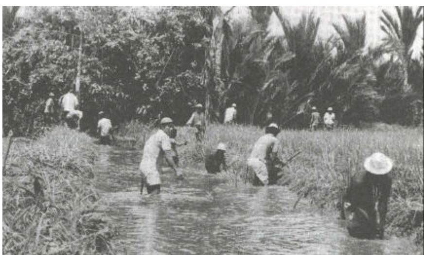
Destroying the water-snail in its favourite shallow water environment is essential to schistosomiasis control

of Medical Biology, Institute of Basic Medical Sciences, University of Tsukuba, Japan, (WHO collaborating centre for chemical control and laboratory culture of amphibious snails host of S. japonicum ); the Hunan Institute of Parasitic Diseases, Hunan, China, (WHO collaborating centre for research and control on schistosomiasis in lake regions); the Institute of Parasitic Disease of the Chinese Academy of Preventive Medicine in Shanghai, China, (WHO collaborating centre for malaria, schistosomiasis and filariasis); and the Department of Parasitology, College of Public Health, Manila, the Philippines, (WHO collaborating centre for research on schistosomiasis).