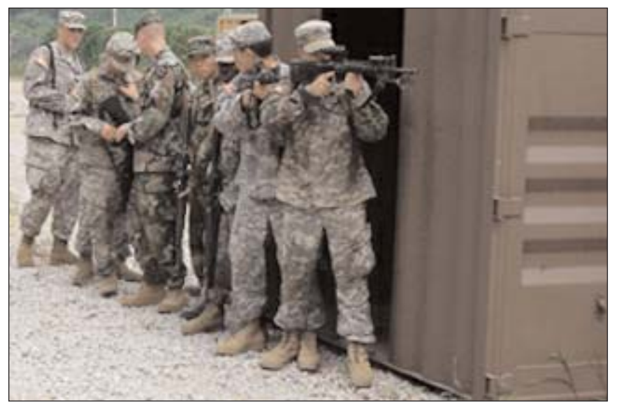
A fire team from A Co, 2-9 Infantry, prepares to enter and clear a room during the urban portion of "Manchu Stakes."

An additional task (Blue Force Tracker familiarization) was added since the Army has adopted this piece of equipment and the chain of command felt that all Soldiers needed to know the basic essentials in its operation and sending free text messages.