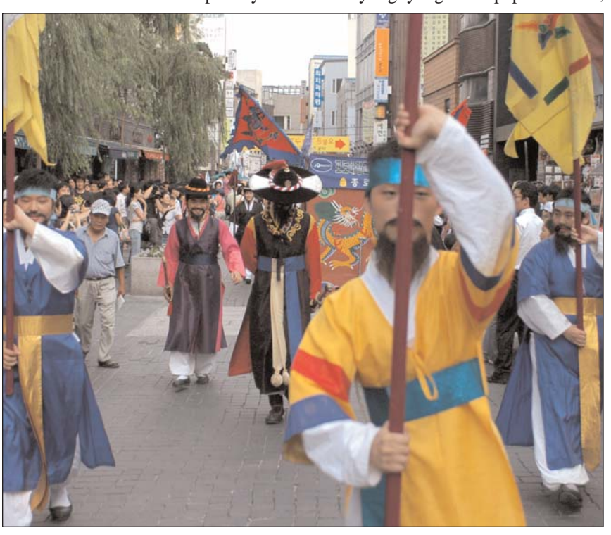
The reenactment of Joseon Dynasty's police officers, Podocheong and Sunragun, is a major event in the street of Insadong on weekends.

2004. "This building is built to extend the horizontal streets of Insadong vertically. On the road, man meets man, man meets object, and man meets culture. That's why there are five entrances to the building but no main gate."