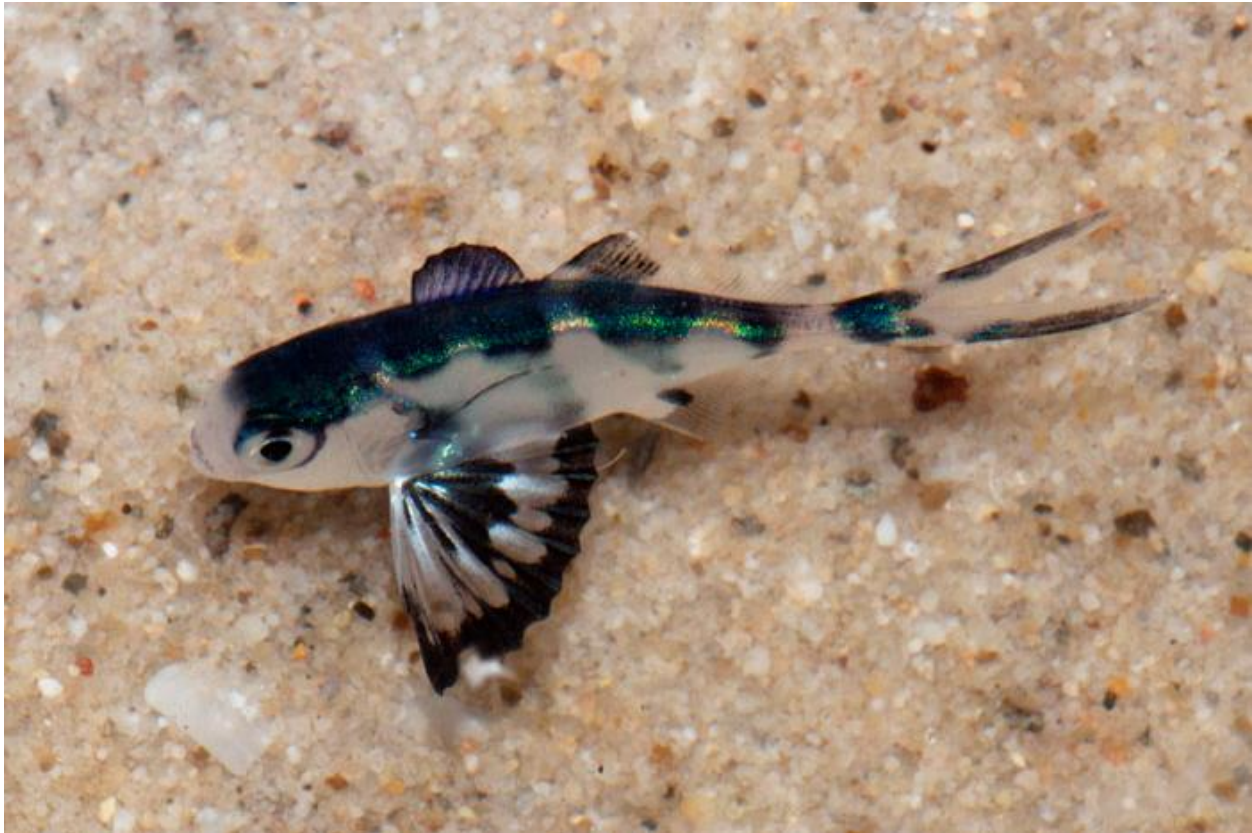
Fig. 1. Man-of-war fish, Nomeus gronovii .

[ http://www.fishesofaustralia.net.au/home/species/2927 , downloaded 9 March 2016]