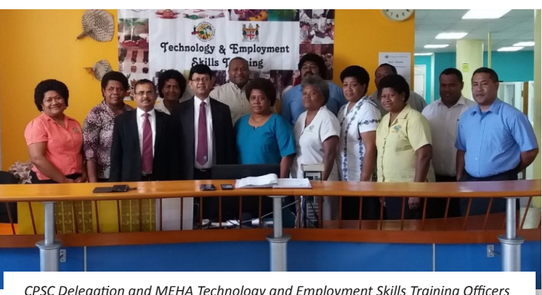
CPSC Delegation and MEHA Technology and Employment Skills Training Officers