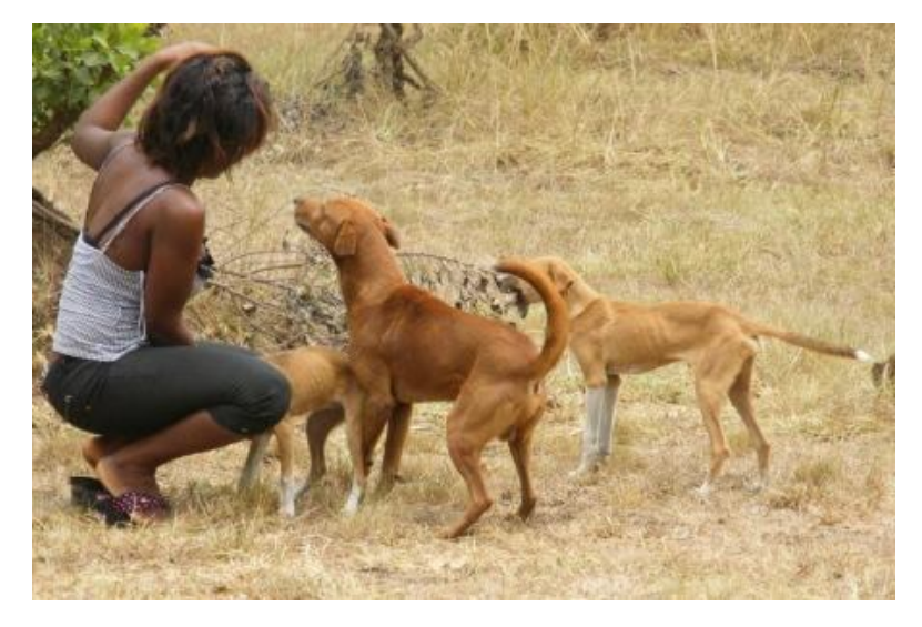
Fig. 10: Red adult male (4+ years), red and white 4-5 month old male and female Avuvis, Akuse, Eastern Region, Ghana