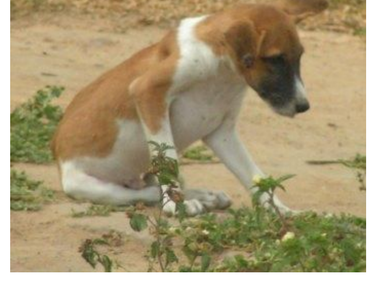
Fig. 7: Young (approx. 3-4 months old) male red and white with partial black mask Avuvi, Lashibi, Greater Accra Region, Ghana