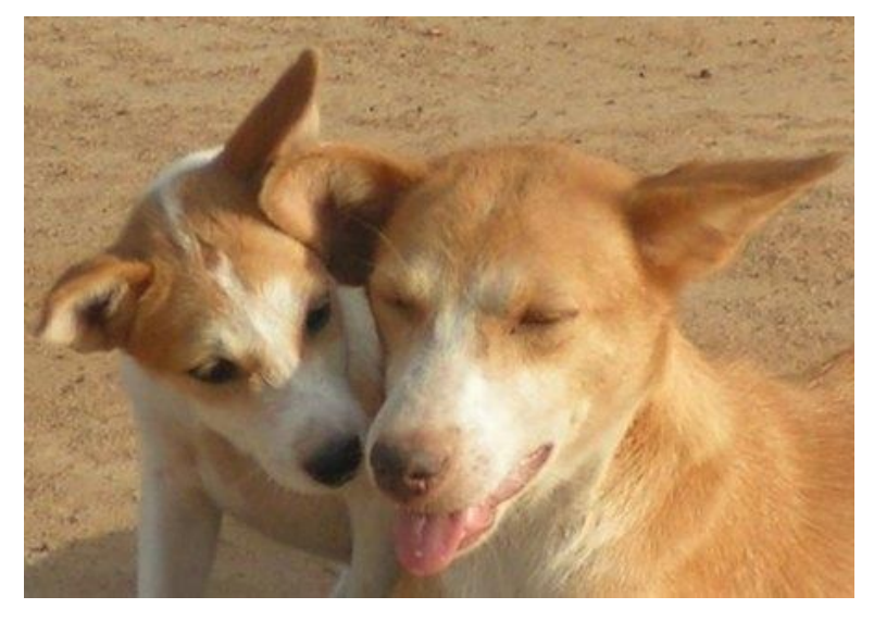
Fig. 8: Bitch and puppy, Baatsona, Greater Accra Region, Ghana

scraps, which are rich in starch and low on animal proteins. They complement their food intake with scavenging and hunting by themselves. They are extremely proficient ratters, and are also good at snatching birds on take-off after they've flushed them. Their preys of choice are all sorts of mouse-to-rat-like animals, and doves, pigeons, and bigger, slower birds.