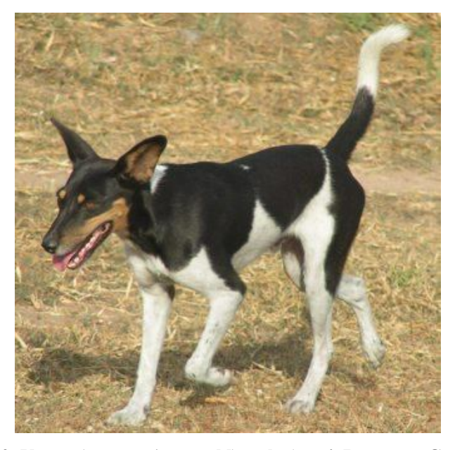
Fig. 9: Young (approx. 1-year old) male Avuvi, Baatsona, Greater Accra Region, Ghana

Because dogs in the Dahomey Gap are allowed to roam around freely, as are fowls, goats, sheep, and other farmyard animals, they can't be allowed to consider these animals as preys, and will either be chained (rarely in a village setting; more often in urban areas) or culled when they display an undiscriminating behavior towards animals (farmyard animals vs. game).