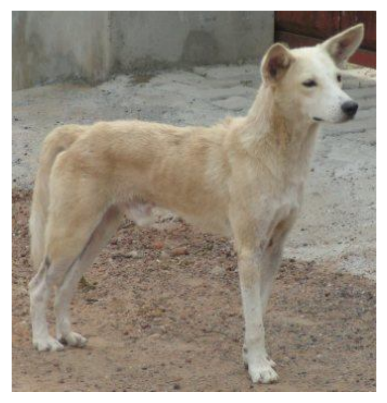
Fig.4: Adult cream Avuvi with thick coat, Baatsona, Greater Accra Region, Ghana

gathered is a one-person endeavour, and necessarily incomplete.