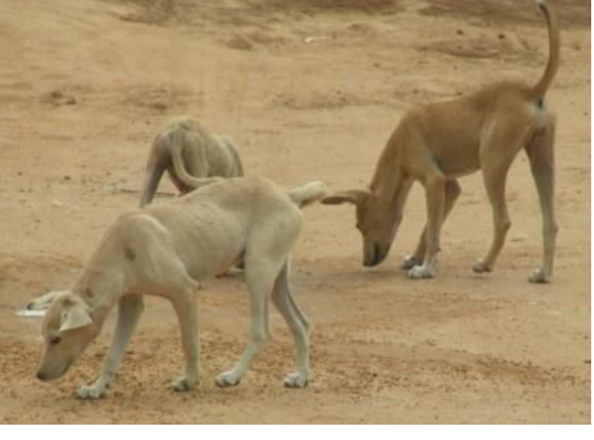
Fig.6: Young (approx.6-months old) cream, sand and brown Avuvis, Baatsona, Greater Accra Region, Ghana

erect. The proportion of subjects with floppy-only ears is not negligible. Skull– flat, medium width, tapering towards the eyes; bitches' skulls narrower than dogs'. Muzzle– shorter than skull, but less markedly so for the bigger/stronger sub-type. Wrinkles may or may not appear on the forehead when the ears are erect. Same for side wrinkles. Nose– Usually black or very dark.