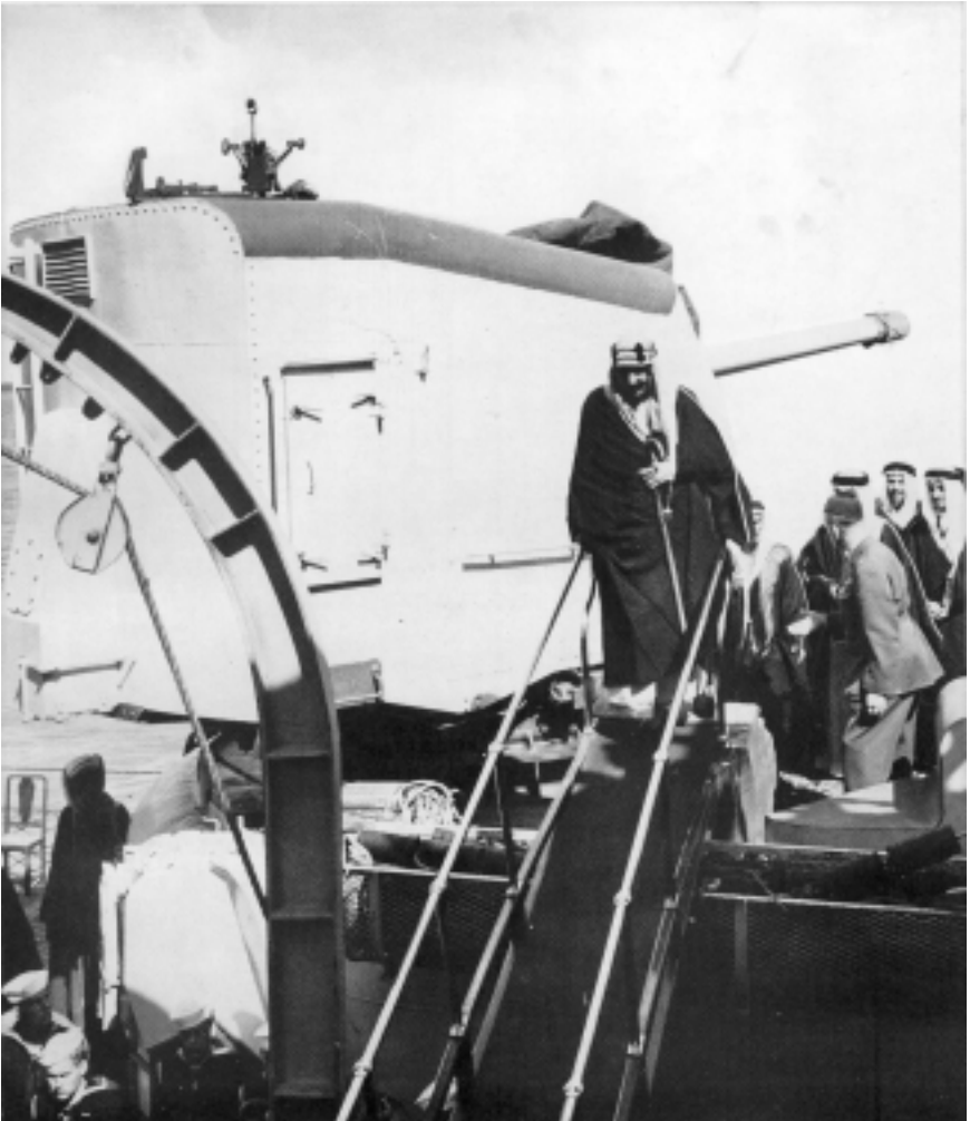
King Ibn Saud comes aboard the U.S.S. Quincy