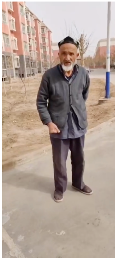
Image: Screenshot from video “What should I do, bite into a building?” depicting elderly Uyghur man’s sarcastic response to the woman filming him. Link to the full video will appear by time embargo is lifted on February 26, 2020.

Authentication: The clear point of the woman’s question is that the man should not be outside. In the current environment, this is most likely because local quarantines require people to stay inside their homes unless they have specific permission to leave. The Uyghur speaker’s accent is an Aksu accent, confirmed after review with multiple native speakers of Uyghur who were raised in or lived in Aksu. Details in the natural and built environment are consistent with streetscapes across the Uyghur Region.