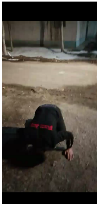
Image: Screenshot from video “Three people are starving in my house” depicting Uyghur man beating his head on the ground. Link to the full video will appear by time embargo is lifted on February 26, 2020.

Authentication: The accent of the speaker was confirmed by multiple native speakers of Uyghur who were raised in or lived in Ghulja. Details in the natural and built environment are consistent with typical streetscapes in Ghulja, including the use of light blue on the walls and roofs of residential buildings. If the video was filmed in Ghulja, it is unlikely that the video was created unless the man’s desperation was genuine. Both the man on camera, and the person filming, took great risks, exposing themselves to potential punishment by authorities both for breaking quarantine orders and for using social media to circulate messages. Circulating unauthorized messages is punishable under new Coronavirus-related regulations issued by Xinjiang’s top court, prohibiting “spreading rumors.”