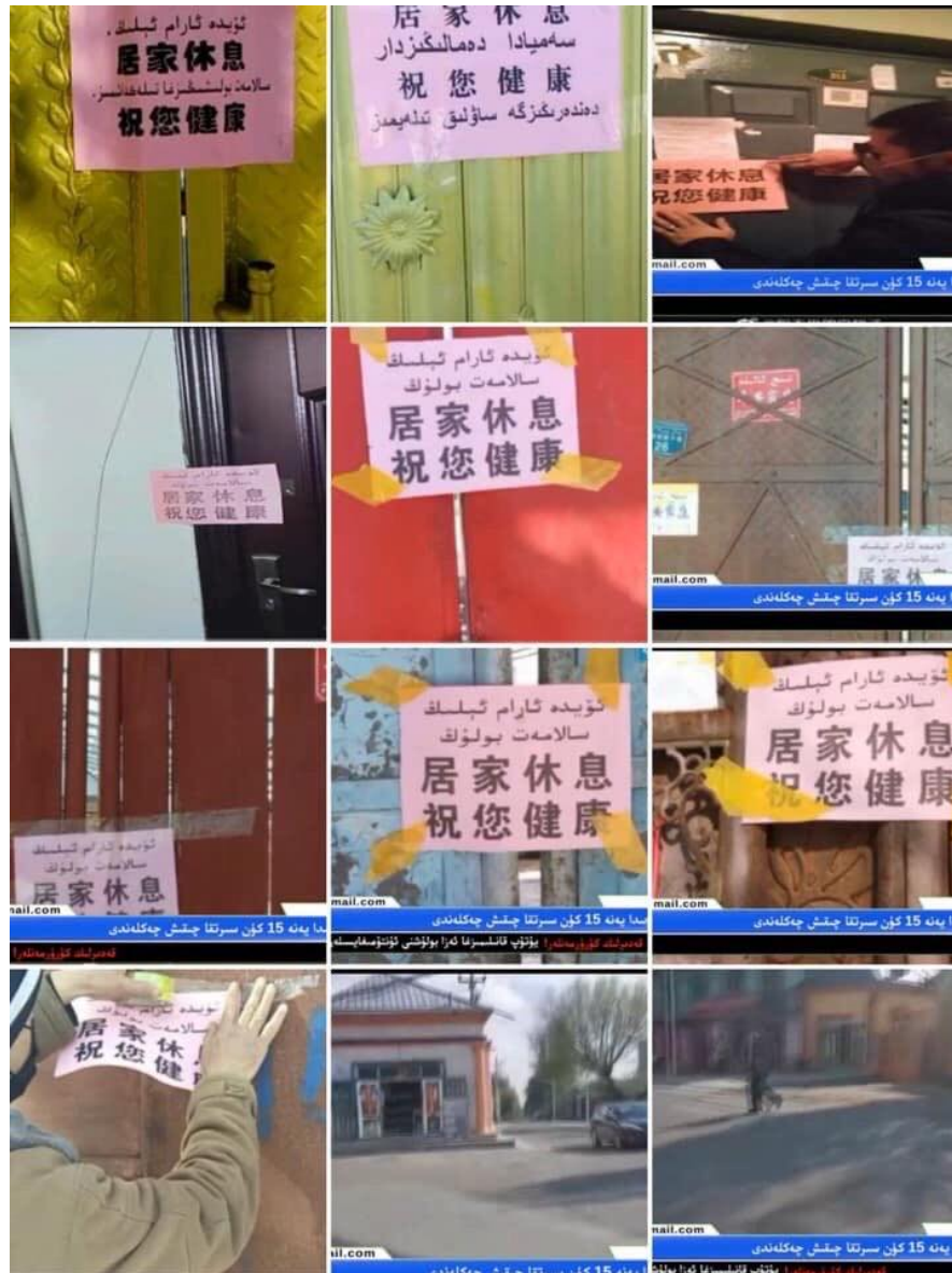
Image: Uyghur-, Kazakh-, and Chinese-language seals, the text of which exhorts residents to “Rest at home and be healthy,” placed over the cracks in doors to local residents’ homes.

Authentication: Language on the printed seals tracks typical government phraseology and style. Our analysis of the photos reveals no earmarks of digital alteration. Other photos posted on social media show seals printed with similar messages in multiple languages, including the Arabic-script Uyghur and Kazakh used in the Uyghur Region.