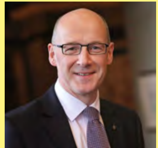
John Swinney stopped the Treasury cutting the Scottish budget by billions