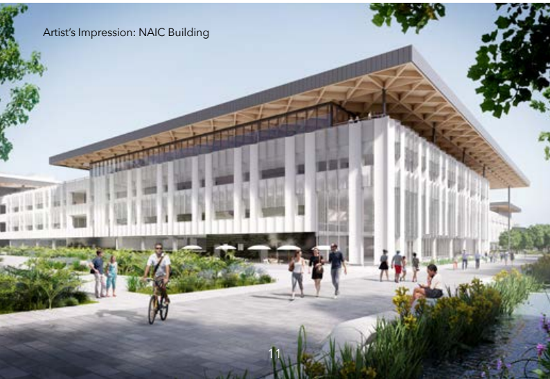
Artist's Impression: NAIC Building

Our new Cancer Research Unit is bringing together our experts in mathematics, physics and engineering to research new treatments using digital technologies. The team is collaborating with researchers and clinicians at the University of Birmingham and NHS partners University Hospitals Coventry and Warwickshire, and University Hospitals Birmingham.