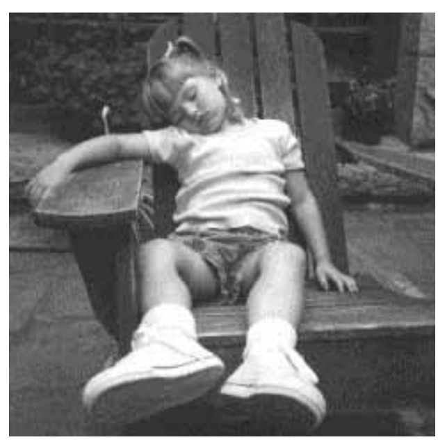
Ever wonder what happens after a day at camp? See above.