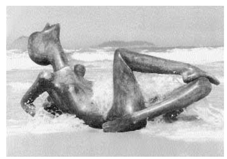
"Agia Talassini" by Ukrainian Brazilian sculptor Oxana Narozniak.

UNITED NATIONS - Oxana Narozniak, a Ukrainian Brazilian artist participated in the international art exhibition "Progress of the World's Women," which opened to the public in the United Nations lobby on June 5 as part of the U.N. "Women 2000" conference. Ms. Narozniak entered her bronze sculpture "Agia Talassini" valued at $12,000, and sold the piece.