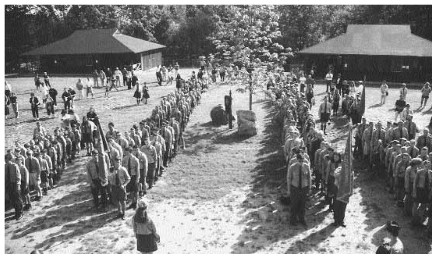
A review of the SUM ranks during an assembly at Zlet.