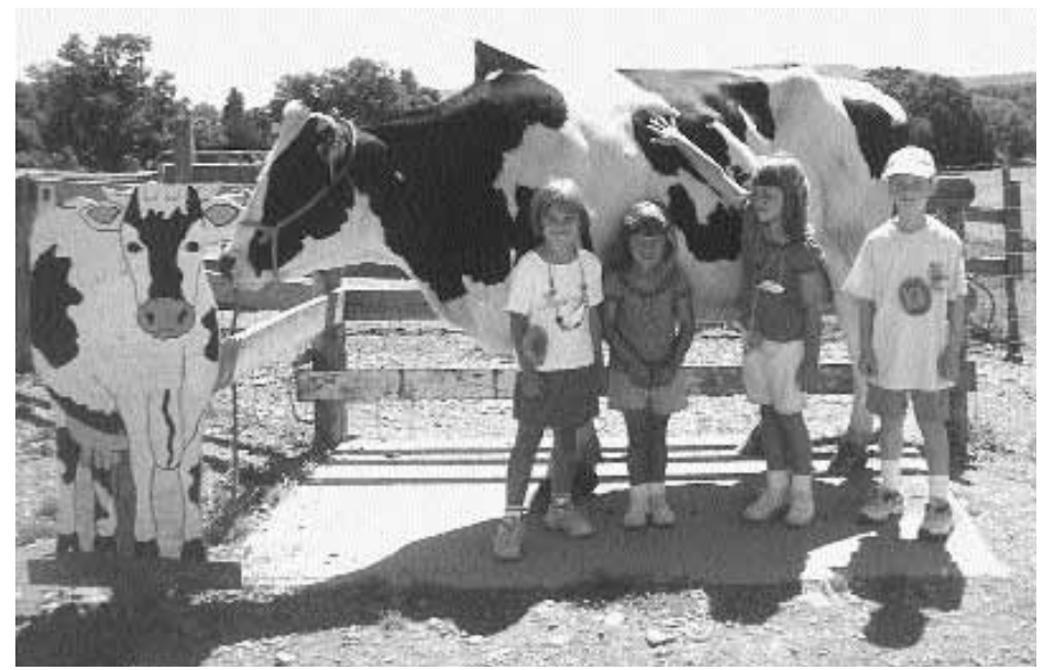
Campers enjoy a visit with a resident of Kelder's Farm.