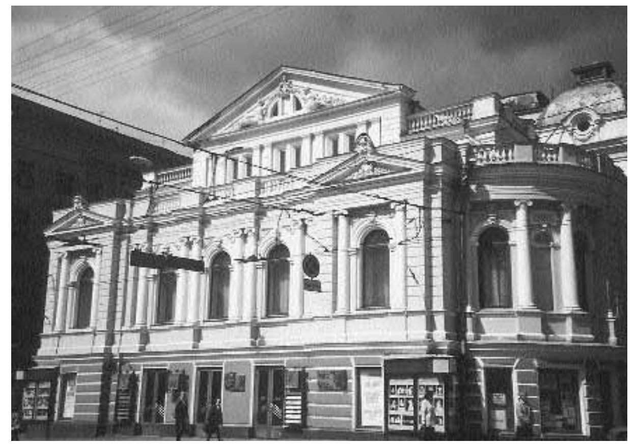
The heart of Kharkiv: the Shevchenko Theater.

Some areas of life continue to encourage interesting literary links. While new hotels have sprung up in Kharkiv, we stayed at the historic building and headquarters of the Rukh Party, which shares space with the Institute of Far Eastern Studies, where Farsi and Sanskrit, among other languages, are taught. Kurbas would have approved.