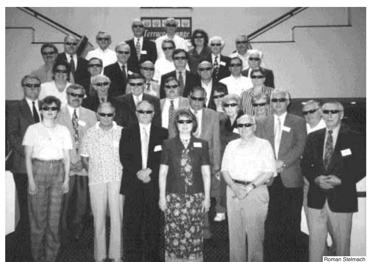
Wearing sunglasses provided by the host credit union, UNCUA members indicate: "Our future is bright."