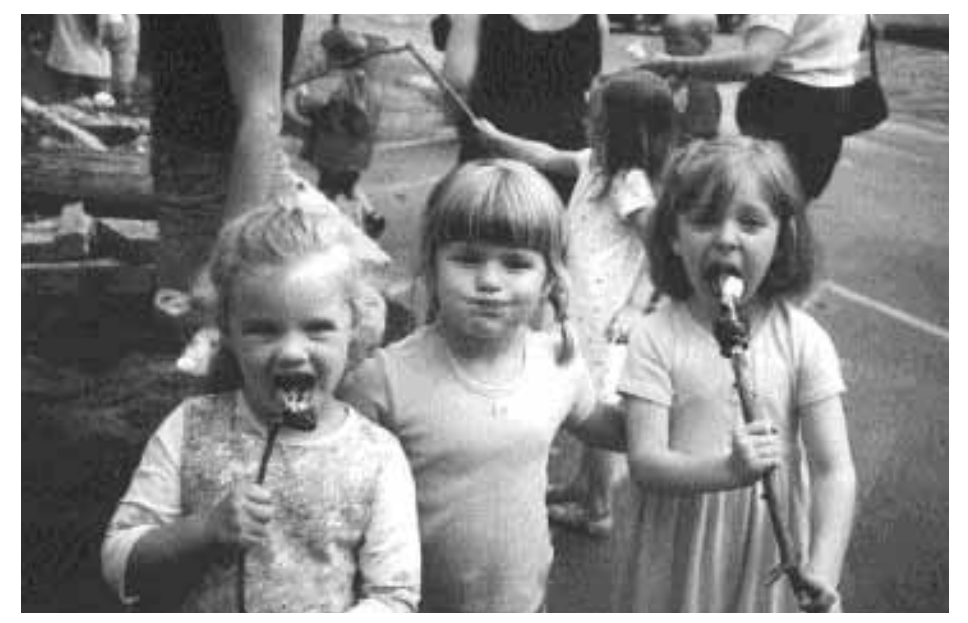
One of the joys of camp: enjoying roasted marshmallows with friends.