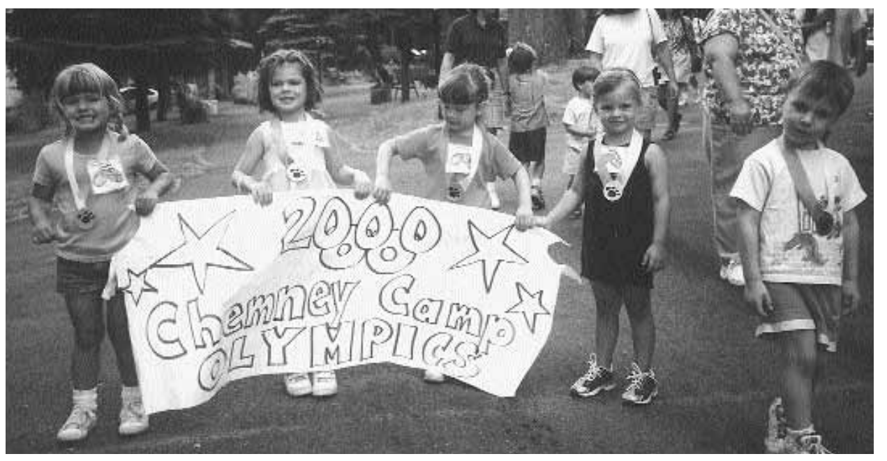
Some of the medal winners at the 2000 Chemney Camp Olympics.