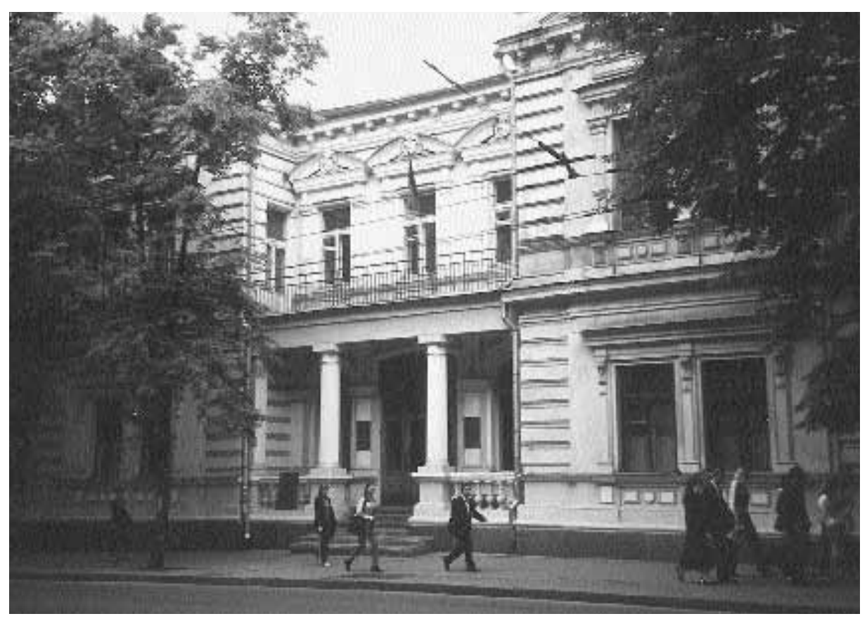
The headquarters of the Rukh Party, located in a historic building in Kharkiv.