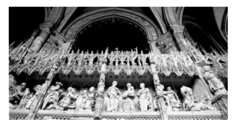
The Choir Screen

small chapel on the north side of the ambulatory, just beyond the chapel devoted to Our Lady of the Pillar (also sixteenth-century), who herself draws crowds of visitors to prayer. In 1927 the cloth was scientifically examined and found to come possibly from the first century AD. There is even a legend that a statue of a virgin with a child, inscribed Virgini pariturae (To the Virgin Who Would Bear a Child), was worshipped in the crypt by pagans who were awaiting a saviour born to a virgin. <sup>13</sup> Popular stories such as these were meant to establish the primacy of the church of Chartres, both as community and as cathedral.