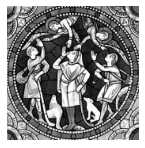
Angels and Shepherds window