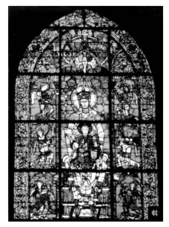
Notre-Dame-de-la-belle-Verrière, central panels