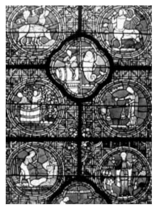
Detail from the Zodiac Window

Because Gothic Chartres was built on the foundations of its Romanesque predecessor, the chapels surrounding the choir, in what the French call the chevet, or apse, of the building, are less prominent than they are, say, at Notre Dame de Paris. But the grace of the ambulatory and its windows more than compensates for this. A good many grisailles are here, grey windows with minimal coloured decoration, to give contrast and extra light. You will also find Charlemagne (considered a saint by many in the Middle Ages) engaged in wonderful battle scenes and, on the south side, the stories of