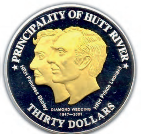
PHR $30 Diamond Wedding silver commemorative marking 60 years of marriage of HRH Prince Leonard and HRH Princess Shirley and 37 th anniversary of secession.