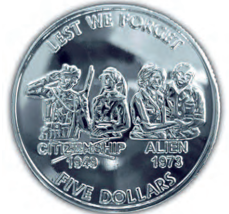
Lest We Forget: Hutt River's 2009 BU $5 that expresses Prince Leonard's concern about the 8,000,000 Australians, particularly that country's service men and women he argues have become stateless people due to legal bungles.