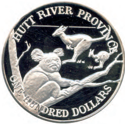
Example of an unauthorized silver high denomination 'HRP' coin struck by Johnson Matthey. The obverse lacks the effigy of Prince Leonard.