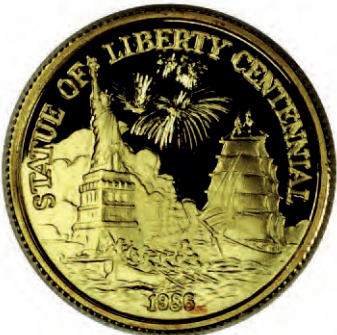
One of Gale's more spurious issues: a .999 fine gold 'sovereign' of 1986. The denomination has no legal standing in the Principality.

coins saluted Captain Cook's ship, HMB Endeavour . Again mintages were 1000 and 500 respectively.