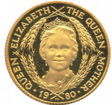
Reverses of HRP gold $100s struck to commemorate Skylab (1979) and The Queen Mother (1980).