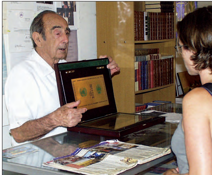
Personal service: Prince Leonard briefs a visitor on the history of the Principality.

The first commemorative coin appeared in 1977. It was a pierced cupro-nickel, 33 mm diameter $1 struck to mark the Silver Jubilee of Queen Elizabeth II. The obverse showed the HRP coat of arms with the inscription "QUEEN'S JUBILEE" on the reverse. Mintage was 1000. In 1978 a similar design, but without the inscription, was produced as a circulation strike. Mintage was 500.