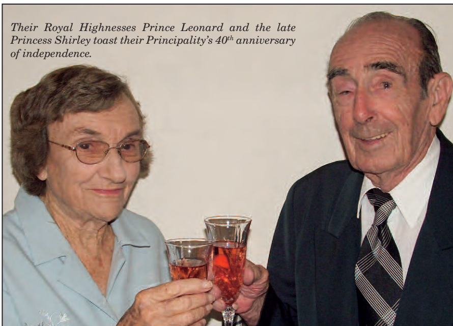
Their Royal Highnesses Prince Leonard and the late Princess Shirley toast their Principality's 40 th anniversary of independence.

The $5 nickel-plated zinc alloy coin is 35 mm in diameter and weighs-in at 16 g. The coins' reverse design stresses the Prince's