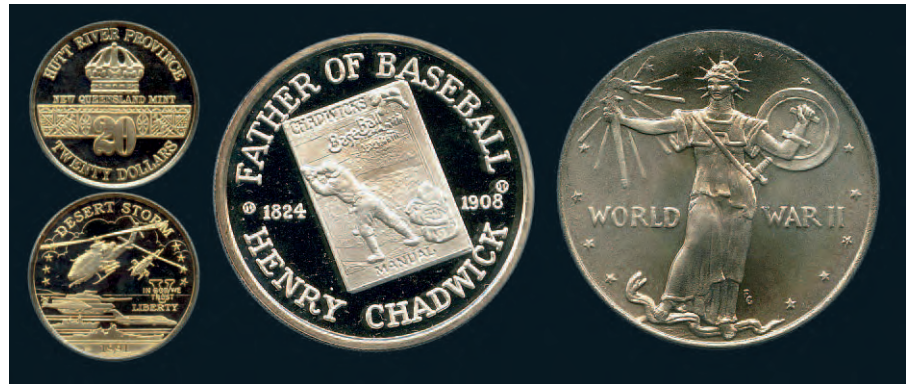
Examples of unauthorized 'HRP' issues struck by The New Queensland Mint. From left .916 gold $20 Operation Desert Storm (1991), .999 fine silver $5 proof "Fathers of Baseball" (1992), cupronickel $5 50 th anniversary WWII with Lady Liberty in Amazon mode.

Gale had inveigled himself into Prince Leonard's trust in the 1970s. He was based in Queensland, on the other side of Australia from HRP. From here he undertook to manage several of HRP's commercial operations including the marketing of its coins and stamps. At no time did Gale have