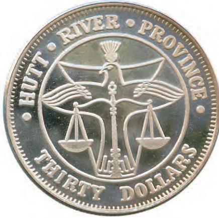
HRP .999 fine silver $30 of 1976.