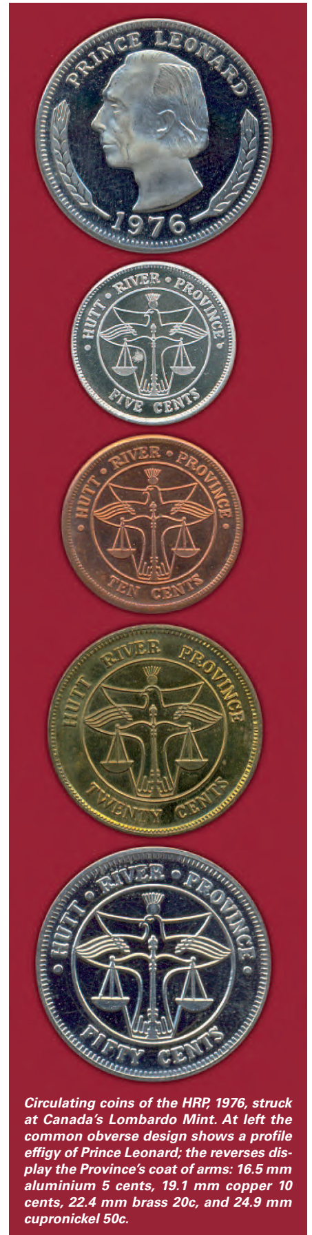
Circulating coins of the HRP, 1976, struck at Canada's Lombardo Mint. At left the common obverse design shows a profile effigy of Prince Leonard; the reverses display the Province's coat of arms: 16.5 mm aluminium 5 cents, 19.1 mm copper 10 cents, 22.4 mm brass 20c, and 24.9 mm cupronickel 50c.