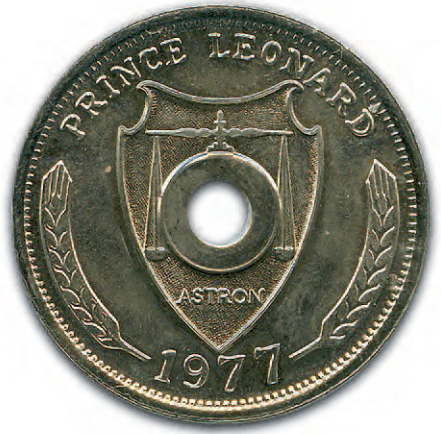
HRP 1977 cupro-nickel holey dollar struck for the Silver Jubilee of Queen Elizabeth II.

Silver $30 and gold $100 coins were issued also in 1977 showing a Red-capped Robin on the reverse of the $30 and a Wedge-tailed Eagle on the $100. Mintages were 1000 and 500 respectively. A small number of trial strikes, possibly 10 coins, of the $100 exist in cupro-nickel. In 1978 $30 and $100