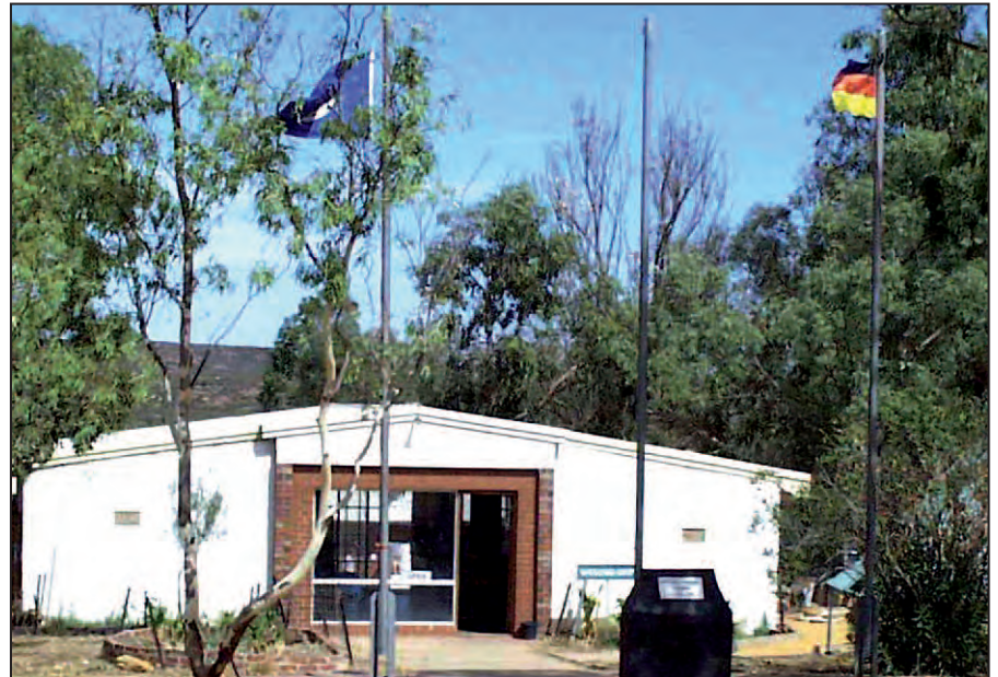
Visitors' Centre, Principality of Hutt River. German dignitaries were visiting on the day as shown by that country's flag flying alongside that of PHR.

power to authorize any coins. All issues, including their designs, had to be approved by HRP.