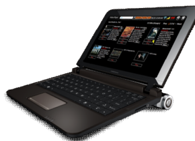
Mobile Internet Devices