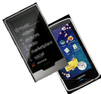
Portable Media Players