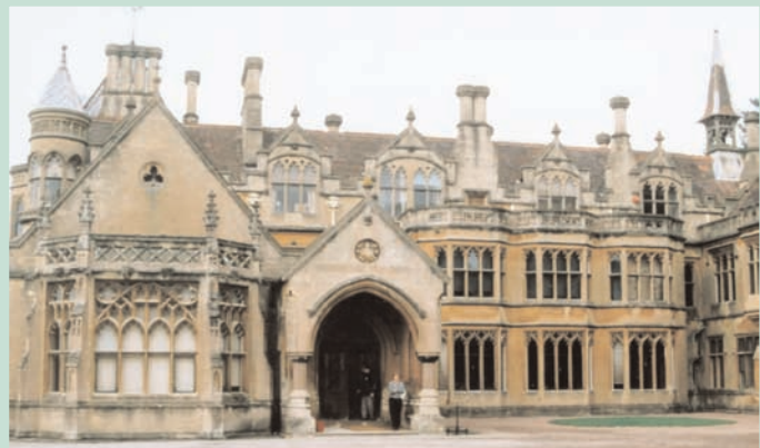
Tyntesfield House Front (21 st Century)