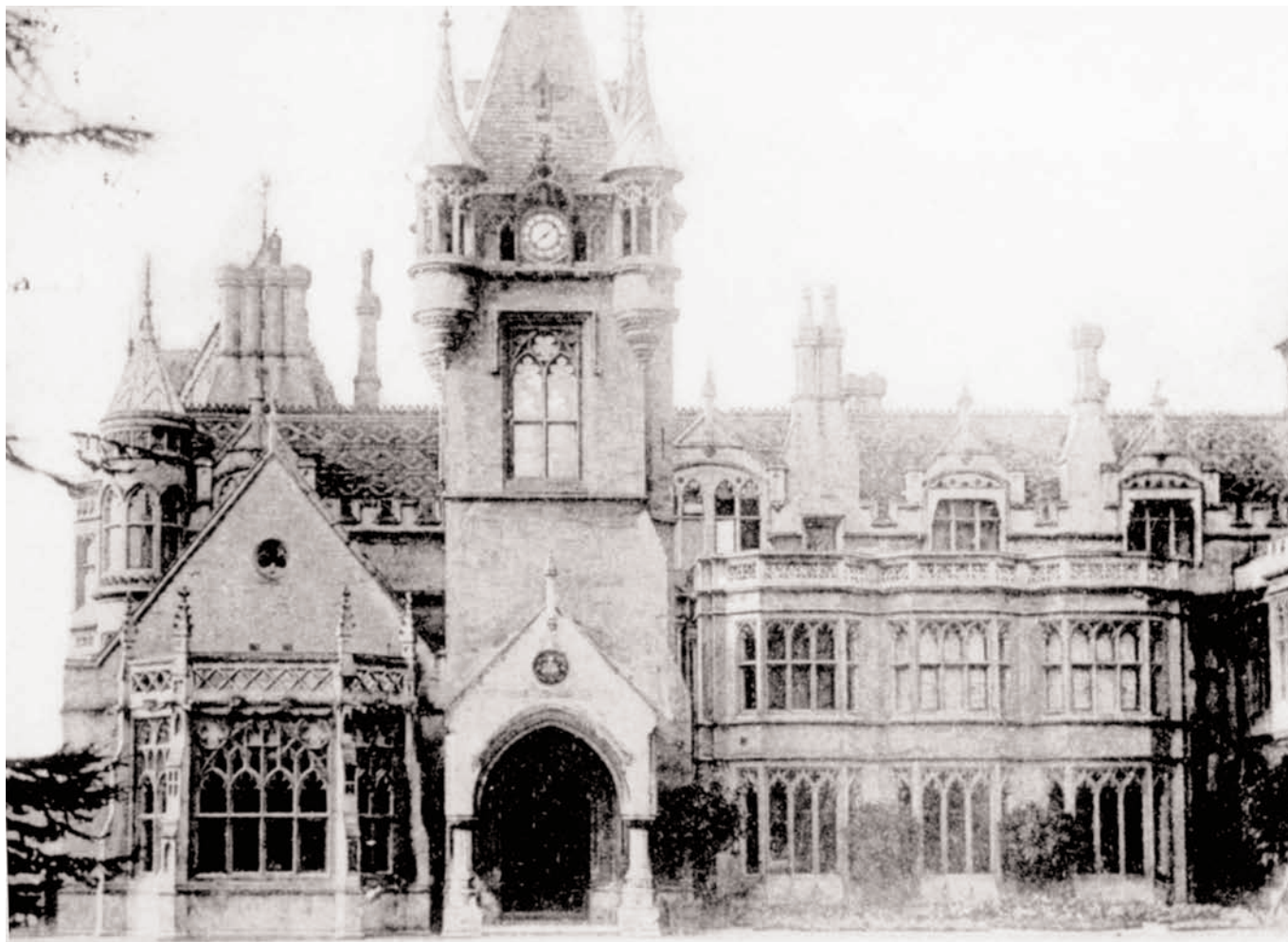
Tyntesfield early 20th Century ( MJ Tozer Collection )

His widow alienated it in 1843 to William Gibbs, Esq. the father of the present (c1900) proprietor, and he by many successive additions and alterations, whereby much of the former fabric became buried within the loftier walls of the later structure, completed the existing palatial building.