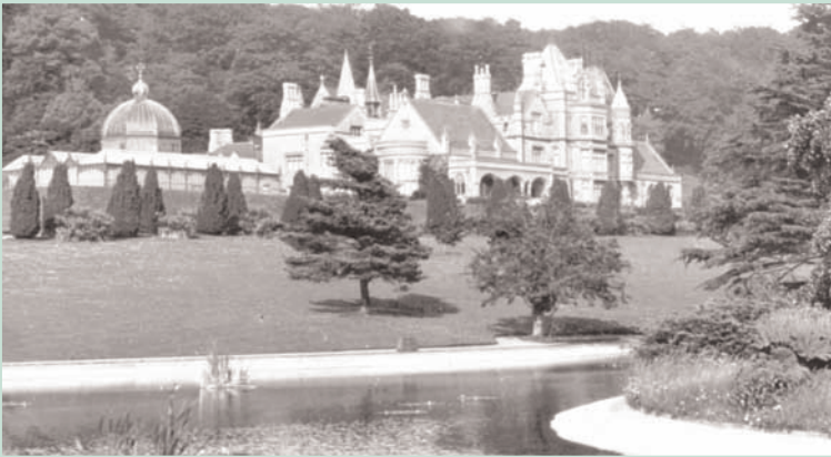
Tyntesfield House, Gardens & Orangery (20 th Century)