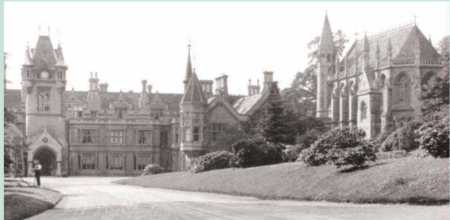
Tyntesfield House & Chapel (20 th Century)