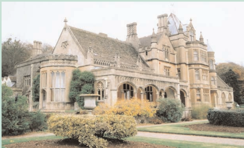
Tyntesfield House side (21 st Century)