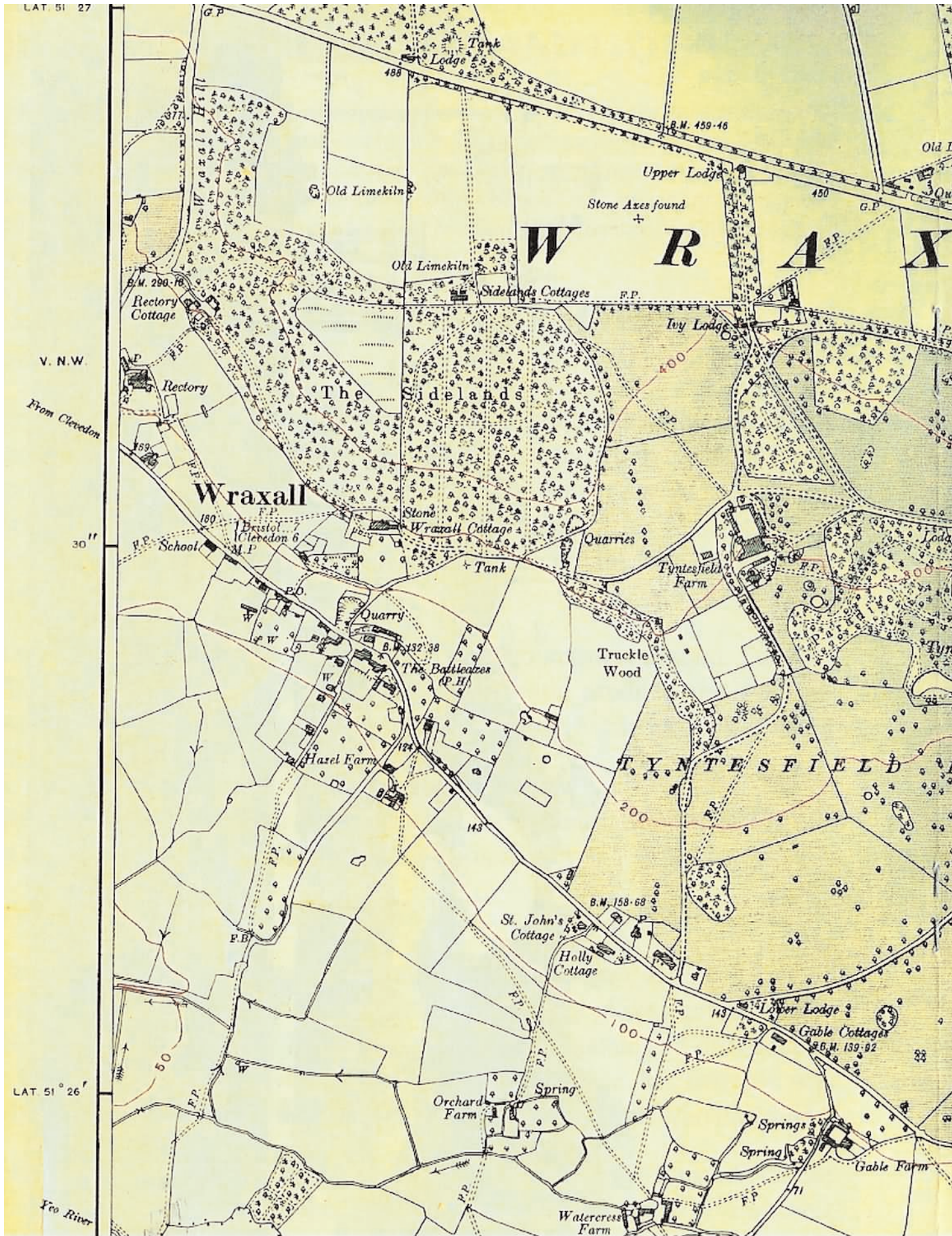
1932 Ordnance Survey