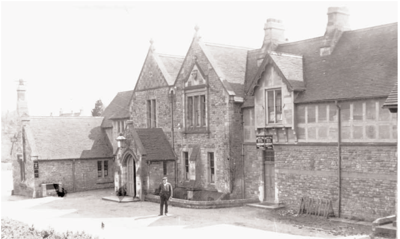
The Battle Axes