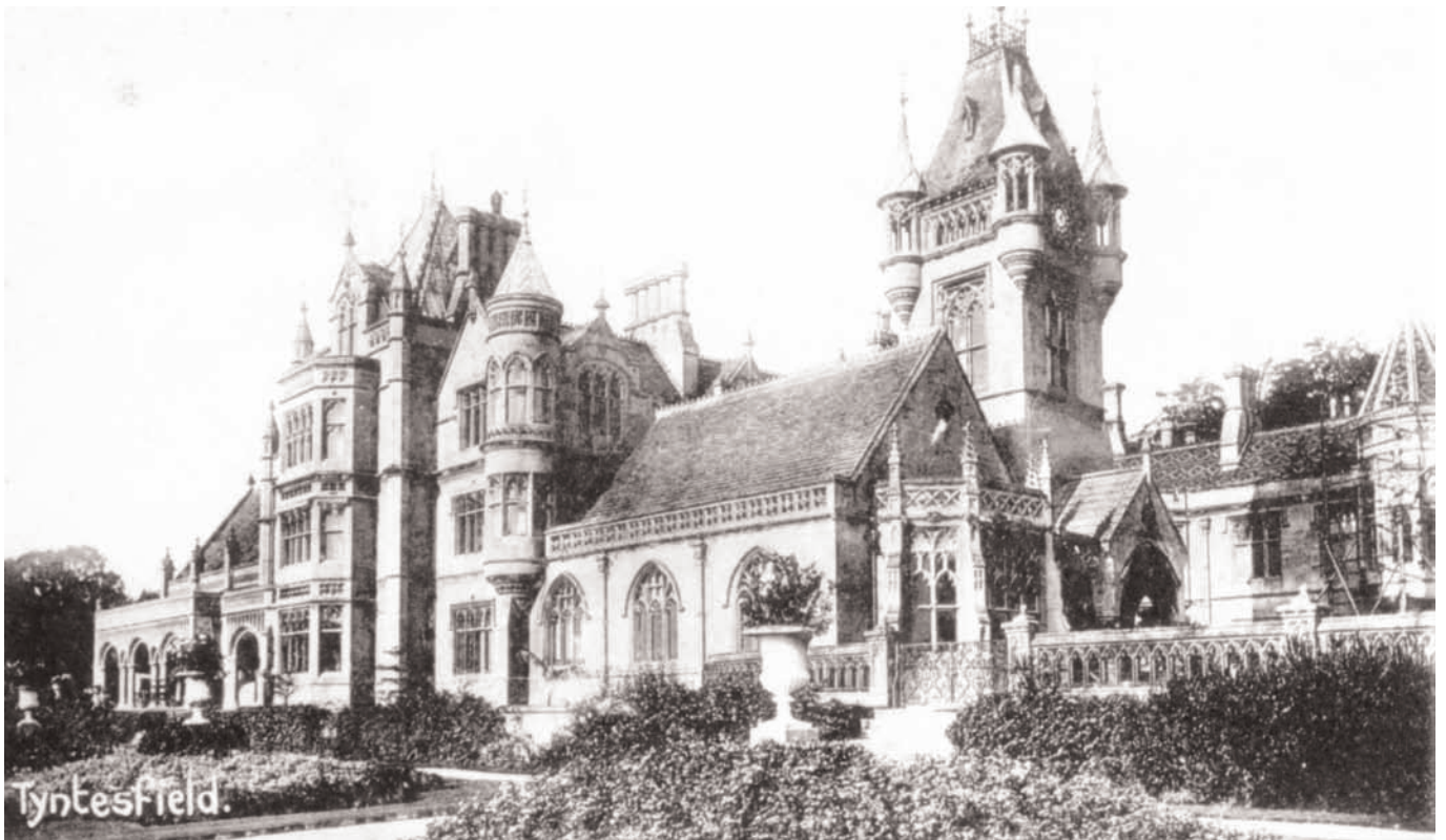
Tyntesfield - early 20th Century ( M J Tozer Collection )