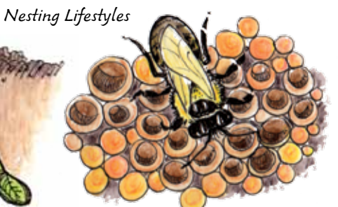
Solitary leaf-cutter bee (Megachile) nest