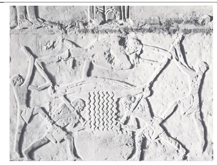
Pressing scene from a recently discovered tomb at Saqqara.

This stone relief captures the Egyptian equivalent of a basket press. Leonard Lesko suggests that they used a large, porous "sack" woven from reeds to hold the must. The sack was then stretched and/or twisted by several men to extract the wine from the fermented must.