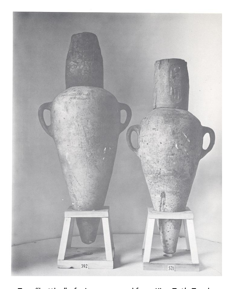
Two "bottles" of wine recovered from King Tut's Tomb

In the pages that follow, I have prepared a synopsis of this short but fascinating book.