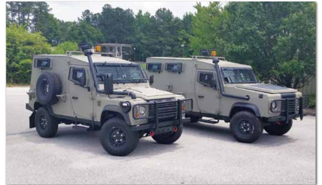
David based on Toyota Land Cruiser LC79 (far) and on Land Rover Defender (near). The David is designed for police, border patrol and paramilitary roles involving high risk, e.g., SWAT, anti-terror, and drug enforcement units, along with similar missions requiring all-terrain capabilities coupled with cost-effective survivability.

Using a commercial off-the-shelf platform reduces initial cost, reduces spare parts costs and reduces maintenance costs. The economical engine and the robust Toyota or Land Rover platform significantly reduce operating costs.