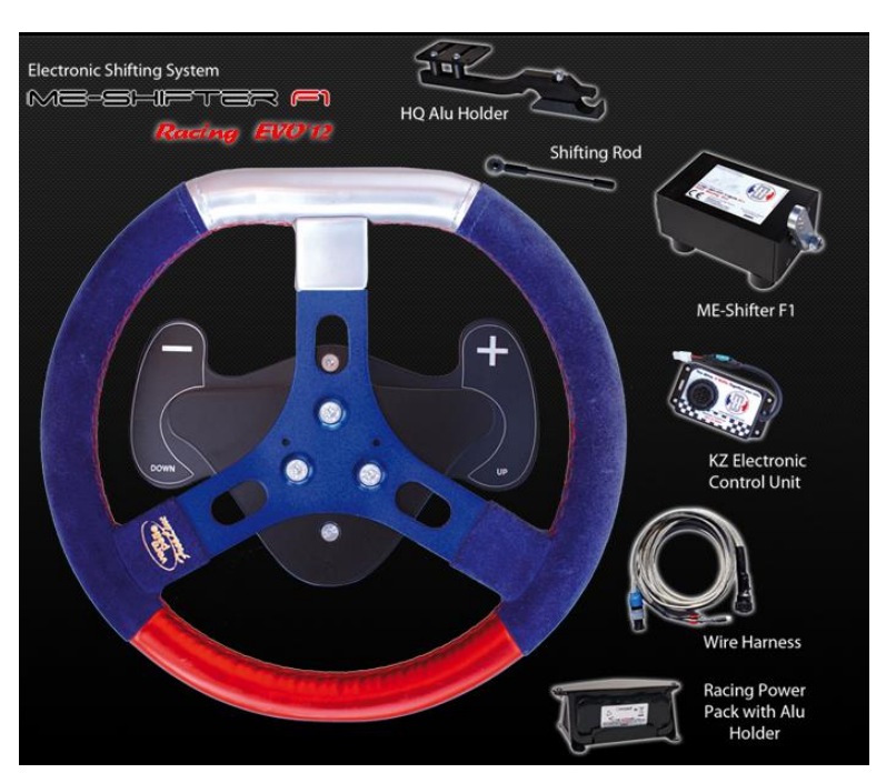
Figure 1: Electronic paddle shifter concept with all parts necessary