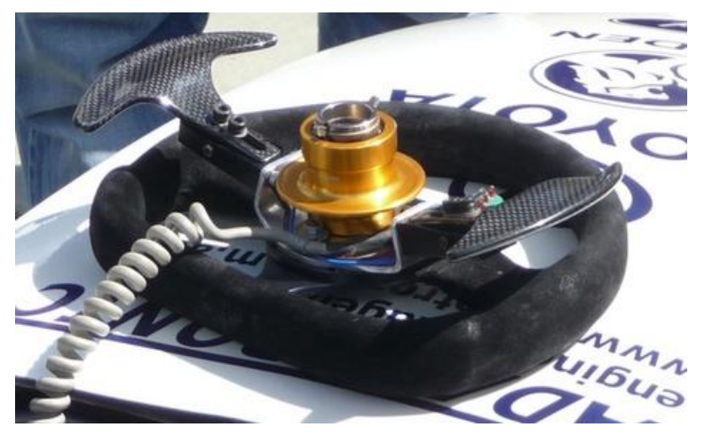
Figure 2: Electronic paddle shifter after setup and connection