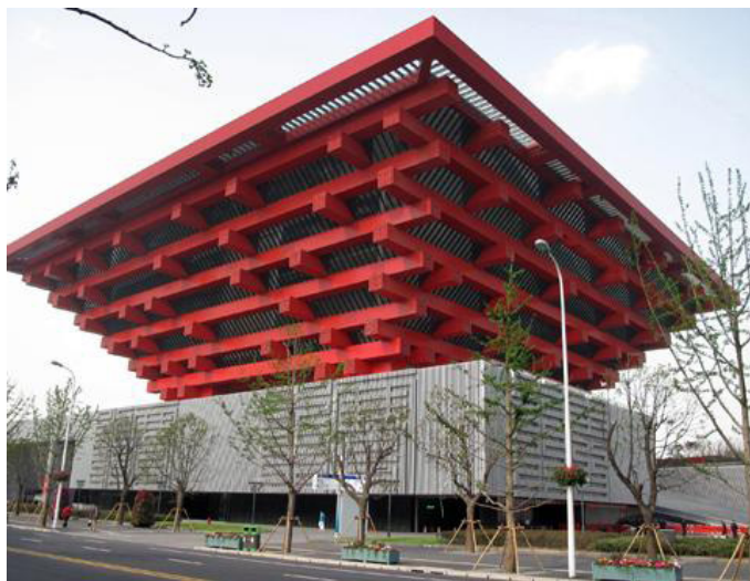
Expo 2010 China Pavilion