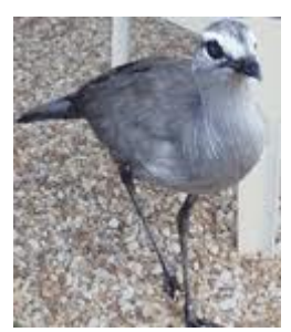
PHOTO (COLOR): LIVING RELATIVES of the phorusrhacoids are the seriema birds of South America: the redlegged (Cariama cristata) and the black-legged, or Burmeister's, seriema [Chunga burmeisteri]. The seriemas, considerably smaller at about 0.7 meter, hunt much as the terror birds did. Seriema nests are in low trees, but the terror birds