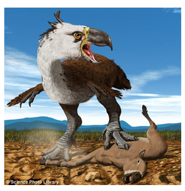
PHOTO (COLOR): Terror bird prepared to eat a small, horselike animal (Brachythrium) that it has caught in a chase and stunned by holding the prey in its beak and beating it against the ground. The bird (Andalgalornis), which was as tall as a human, was one of many species-all now extinct-known as phosusrhacoids. They were the dominant terrestrial carnivores of South America until about two million years ago.