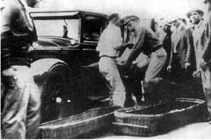
Police removing Kahahawai's naked body from the car

Massie and his mother-in-law Grace Fortescue, with the assistance of two naval enlisted men Edward John Lord and Albert Orrin Jones, then devised a plan to kidnap and force a confession from Joseph Kahahawai, Jr., one of the alleged attackers. Their "interrogation" in Mrs. Fortescue's rented house went awry resulting in the shooting to death of Kahahawai and the arrest of Massie, Mrs.