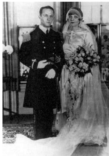
The Massies at their wedding, 1927

Their marriage was stormy from the beginning. His "hard-drinking" bride of sixteen found it difficult to adjust to the social obligations of a naval officer's wife. Even Massie's transfer to Pearl Harbor in exotic Hawaii, in the spring of 1930, did little to quell their troubled marriage. As Thalia's drinking and extra-marital affairs increased, their arguments grew louder and more frequent. Thalia's habits of prancing around their backyard partially clothed and insulting Massie's fellow officers and their wives at parties became an embarrassment to Massie and a hindrance to his naval career, inducing him to threaten Thalia with divorce.