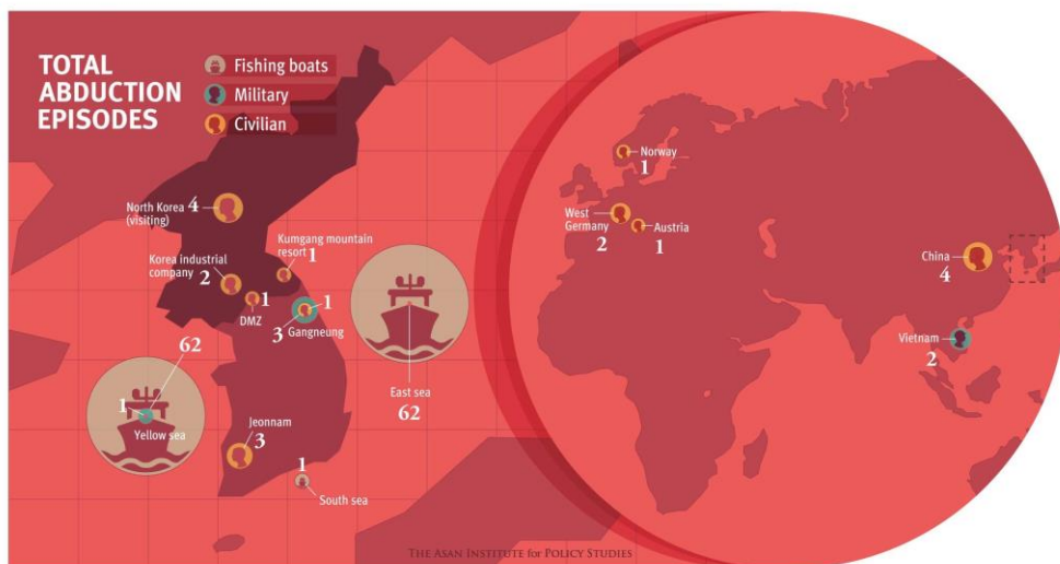
Total abduction episodes (Go, 2018: Online)

Since the beginning of the Korean War on June 25 th 1950, approximately 200,000 civilians and soldiers have been abducted by the DPRK’s regime (COI, 2014: Paragraph 1011). In 1946, Kim Il-sung stated that, “Not only do we need to search out all of Northern Chosun’s 1 intelligentsia 2 in order to solve the issue of a shortage of intelligentsia, but we also have to bring Southern Chosun’s intelligentsia [to the North]” (Go, 2018: Online). Following this time, many citizens were abducted during the