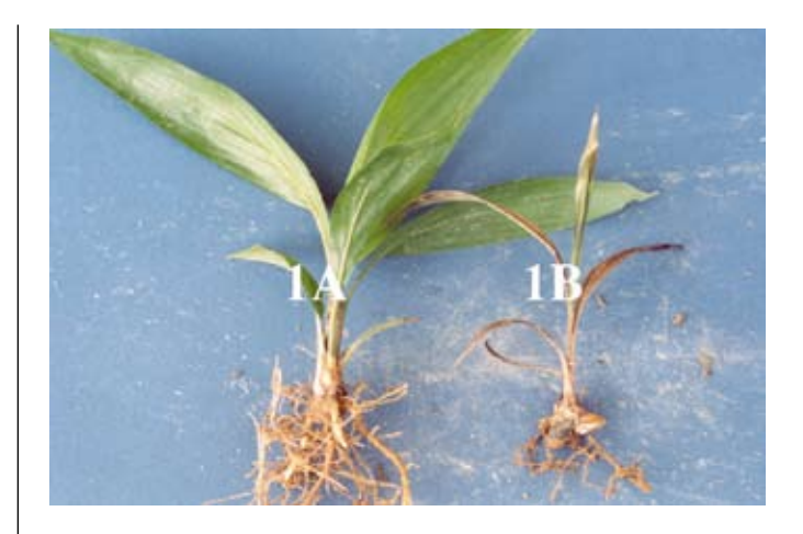
Figure 1. Uninoculated seedling without disease symptoms (1A) and inoculated seedling with foliar symptoms and fruiting body of Ganoderma (1B) at six months after inoculation.

To test the pathogenicity of different Ganoderma species, RWBs ( 6 \times 6 \times 6 cm) were inoculated with the following isolates of Ganoderma: G. boninense, G. zonatum, G. miniatocinctum, G. tornatum, G. lucidum and G. philippii (Idris et al., 2000a, b). The inoculated RWBs were incubated (at 27°C) for approximately 60 days or until completely colonized by the fungus. Oil palm germinated seeds (commercial DxP standard cross) were inoculated using the technique in Experiment 1. The results are presented in Table 2. At six months, no disease symptoms were observed on the seedlings inoculated with G. tornatum, G. lucidum and G. philippii but apparent on those inoculated with G. boninense (45%), G. zonatum (45%) and G. miniatocinctum (25%). In addition, no internal disease symptoms were observed in the seedlings