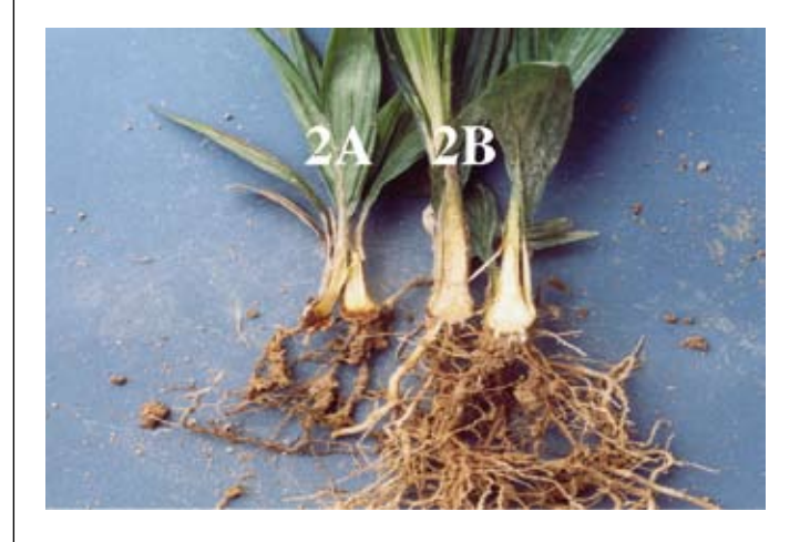
Figure 2. Inoculated with internal symptoms (2A) and uninoculated without internal symptoms (2B). Oil palm seedlings at six months after inoculation.