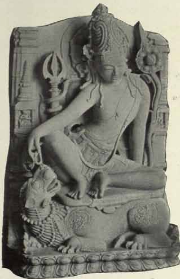
a. BODHISATTVA SIMHANADA—AVALOKITESVARA.