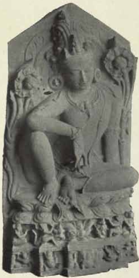
b. PADMAPANI AVALOKITESVARA.