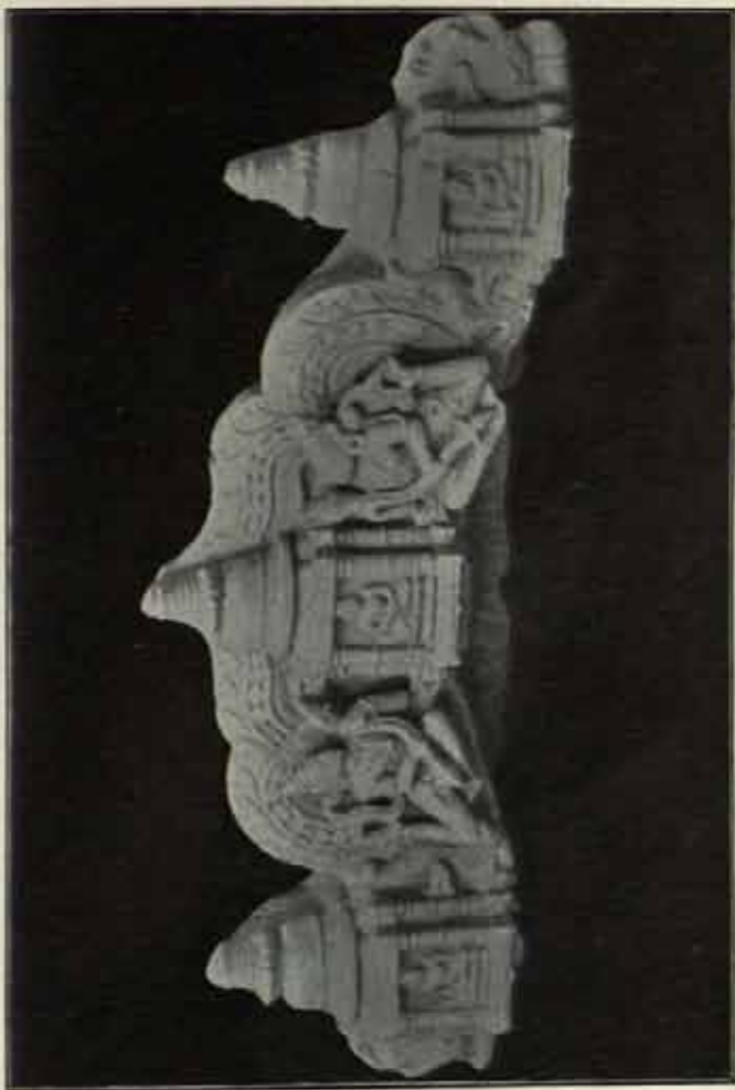
b. FRAGMENT OF THE BACKSLAB OF AN IMAGE.