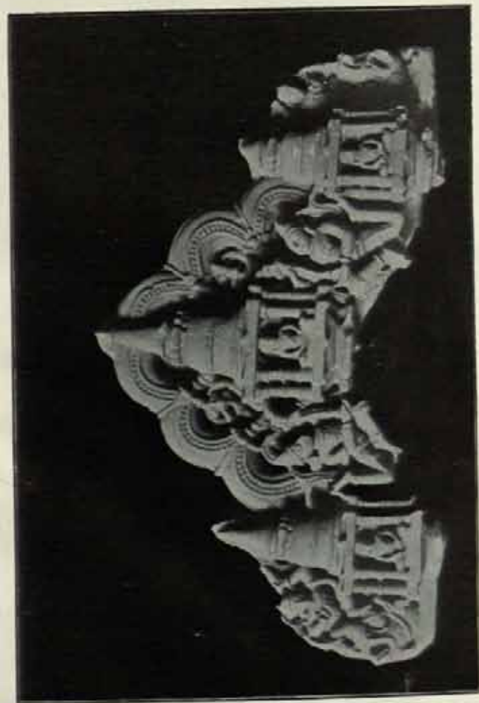
a. FRAGMENT OF THE BACKSLAB OF AN IMAGE.