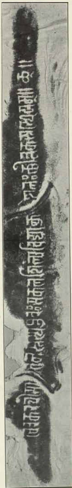
c. INSCRIPTION ON THE PEDESTAL OF THE STATUE OF THE BODHISATTVA SIMHANADA—AVALOKITESVARA.