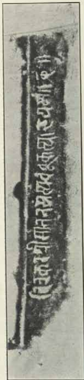
d. INSCRIPTION ON THE PEDESTAL OF THE IMAGE OF TARA.