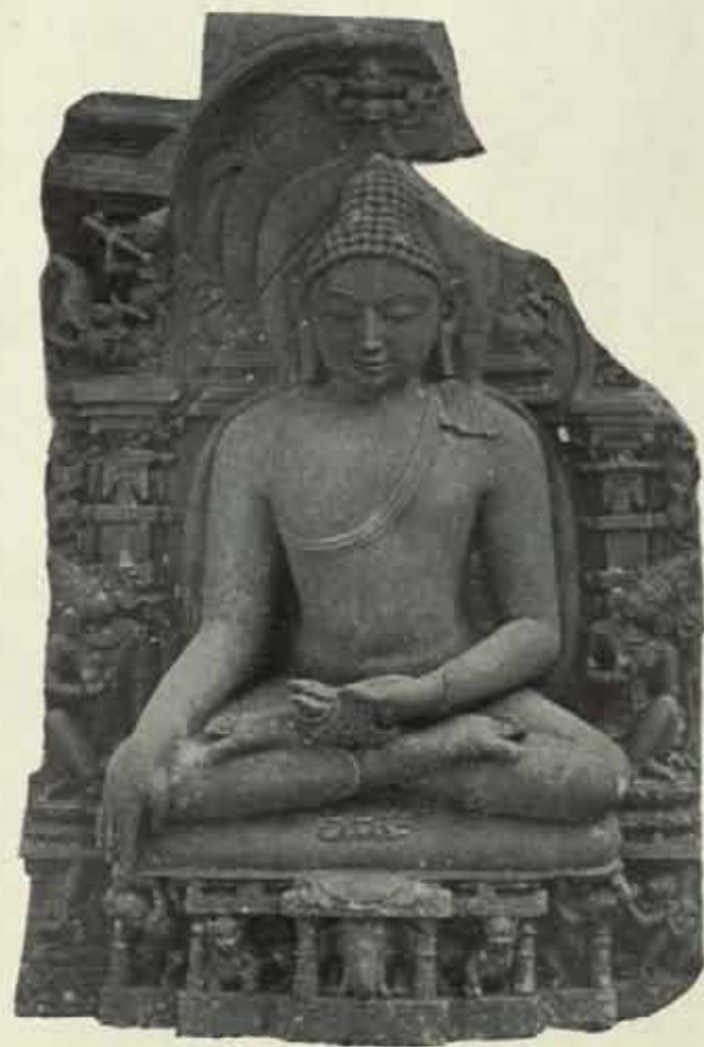
d. GAUTAMA BUDDHA.