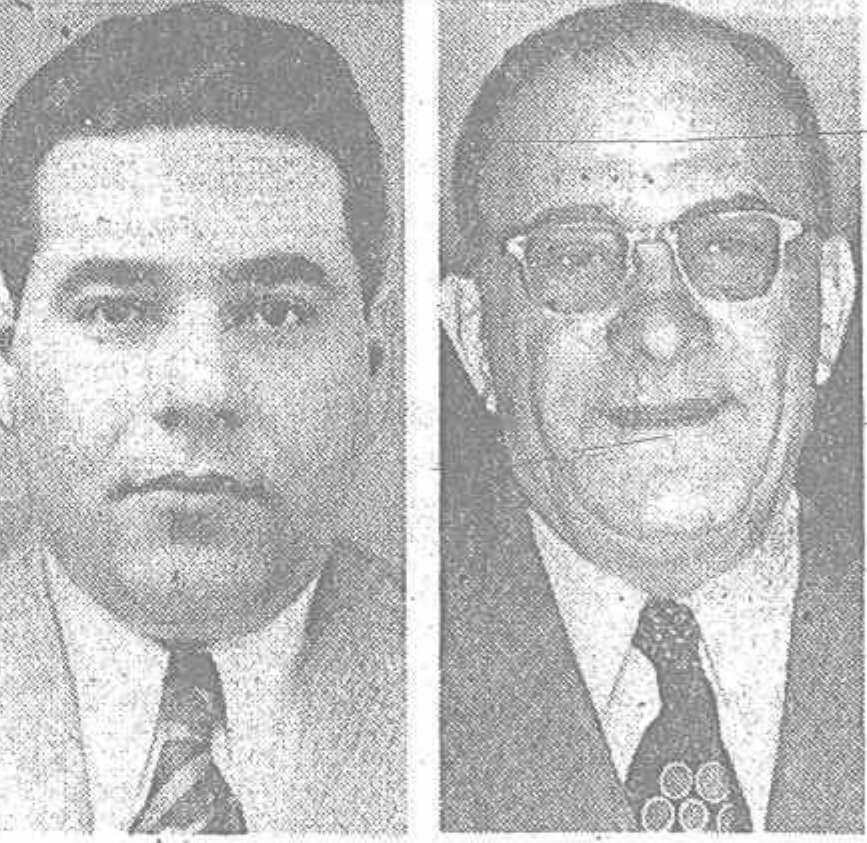
JOSEPH BARBARA VITO GENOVESE

A federal jury found Abel guilty on charges of conspiring to transmit vital U. S. defense and atomic secrets to Russia, conspiring to gather these secrets, and failure to register with the State Department as an agent of a foreign country.