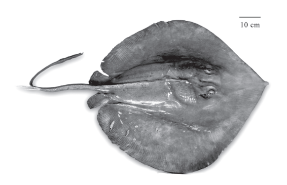
Fig. 2. Plesiobatis daviesi female with two spines (156 cm TL)