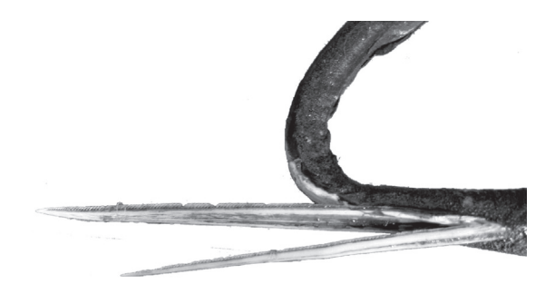
Fig. 3. Enlarged spine image

The gut content analysis of the two P.daviesi specimens collected showed semi-digested teleosts and shrimps. White et al. (2006) reported that the fish feeds primarily on small fishes, crustace-ans, cephalopods and numerous mesopelagics suggesting a possible feeding migration into water column. There is no targeted fishery for P. daviesi , though incidental occurrences in deepwater trawls and longlines have been reported from Taiwan and Indonesia. The IUCN Red List status has classified the species as least concern (IUCN, 2009).