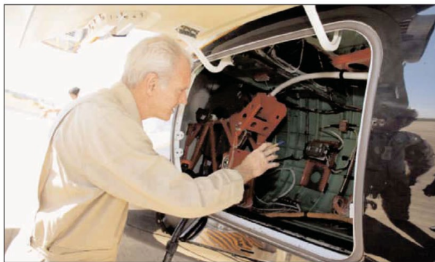
The aft external baggage compartment will hold 45 cubic feet of gear, including four sets of golf clubs or four pairs of skis. Production aircraft will have a baggage door that hinges open from the leading edge rather than swinging up, thereby improving access to the compartment.

During the climb we checked short period pitch and roll stability. The aircraft was adequately damped in pitch, but light turbulence caused slight pitch changes that needed to be corrected. Aerodynamic Dutch roll damping was just satisfactory,