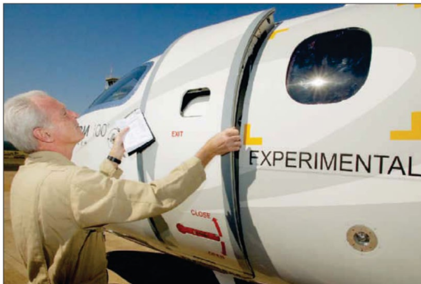
The airstair entry door is the largest in class, measuring 4.5 feet high by 2.1 feet wide. A pressure-relief vent door assures the cabin is depressurized before the door is unlatched.

pusher and flight control movement. Out of the chocks, we noted that brake pedal pressure was heavy, quite similar to that of the EMB 145. Nosewheel steering was very positive. There was some chattering of the wheel brakes during taxi to Runway 20.