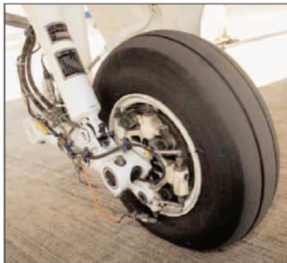
Long travel, trailing-link landing gear result in smooth touchdowns and a comfortable ride while taxiing over rough surfaces. The Meggitt brake-by-wire system, however, needs fine-tuning to provide better anti-skid performance.

During the walk-around, Bragança pointed out numerous design features that make the Phenom 100 easy to maintain and operate. A central diagnostic computer, for