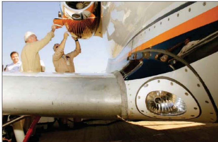
Strip away the paint and it's readily apparent that time-proven aluminum alloys are used for most of the Phenom 100's airframe structure.

performance, for instance, is good but not class leading. The Phenom 100 will have a 3,400-foot sea-level standard-day FAR Part 23 Commuter Category takeoff field length. Top competitors need 5 to 10 percent less pavement using the same rules.