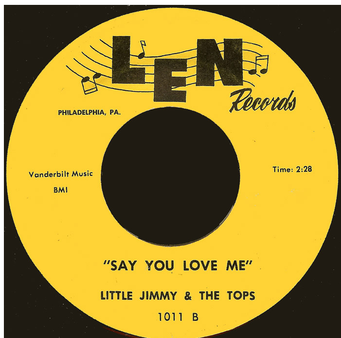
Issuing of "Puppy Love" b/w "Say You Love Me" on the (yellow) Len label, ca. 1960. Later pressings were on an orange Len label.