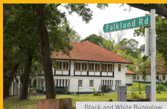
Black and White Bungalow