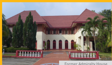
Former Admiralty House