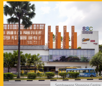
Sembawang Shopping Centre

For more information and photo credits, visit the Draft Master Plan 2013 exhibition website at www.ur.gov.sg/MS/DMP2013 .