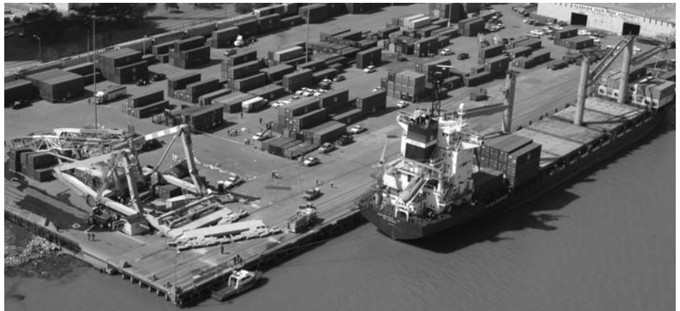
MOBILE, Ala.- Members of Coast Guard Sector Mobile are investigating an accident in Mobile Bay, Ala., involving the container-ship Zim Mexico III and a sky-crane Thursday March 2, 2006, at approximately 11:30 a.m.