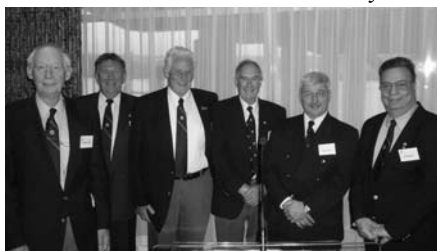
The Company of Master Mariners of Canada (CMMC) National Council Officers.