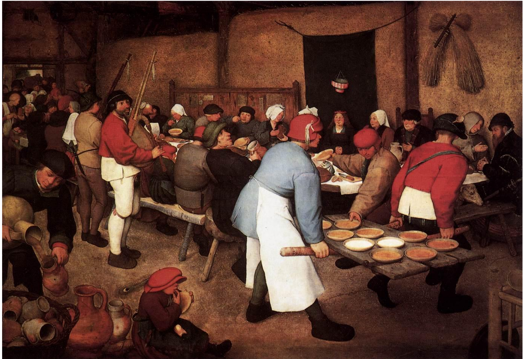
BRUEGEL, Pieter the Elder, Peasant Wedding, c. 1567, Oil on wood, 114 x 164 cm, Kunsthistorisches Museum, Vienna