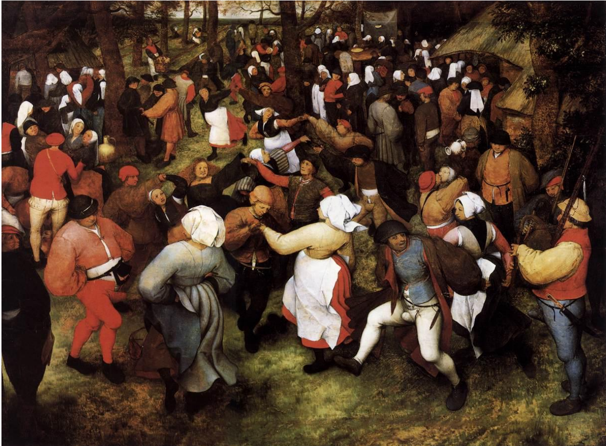
BRUEGEL, Pieter the Elder Wedding Dance in the Open Air 1566 Oil on panel, 119 x 157 cm Institute of Arts, Detroit