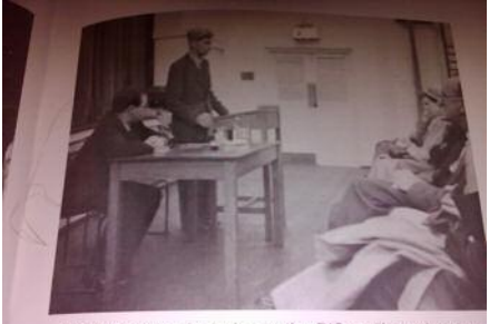
Olaf Stapledon lecturing to the BIS on "Interplanetary Man" on 9<sup>th</sup> October 1948.

London 2011: Many luminaries have given talks at the BIS over the years but few have had more impact on its members than the one delivered by Olaf Stapledon in 1948. Any internet browser will give you a pencil sketch of the man: born May 10 1886 (just nine years before publication of The Time Machine) in Seacombe near Liverpool, a noted British philosopher and writer (of both fiction and non-fiction), married with three children, who died unexpectedly of a heart attack in September 1950. But look beyond these hastily drawn details and you find a man who should be far more famous than he is.