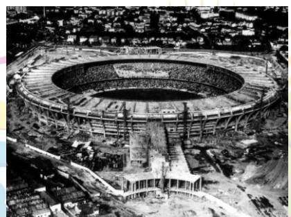
From left to right: Estadio Centenario in Montevideo, venue for the first FIFA World Cup Final in 1930. Wembley Stadium, venue of the 1966 World Cup Final. Maracana Stadium still under construction for the 1950 World Cup finals