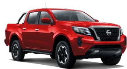
Burning Red ‡