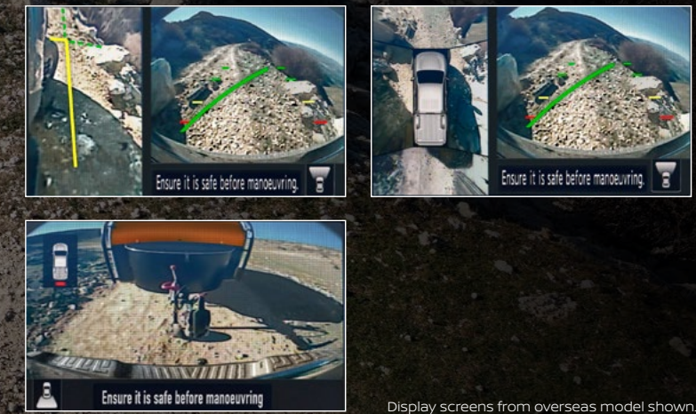
Display screens from overseas model shown.

Trailer Hook-up Having a 360-degree view 3 comes in especially handy when connecting to a trailer to help you place your Navara perfectly. It is also great when negotiating a tight parking spot.