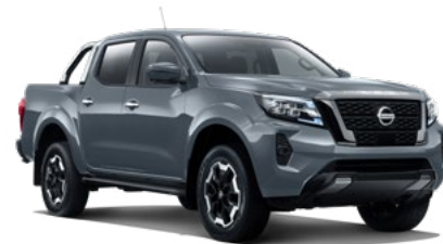
Twilight Grey ‡