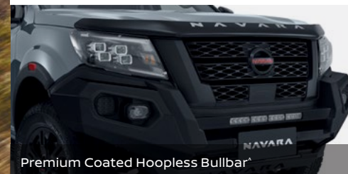
Premium Coated Hoopless Bullbar*