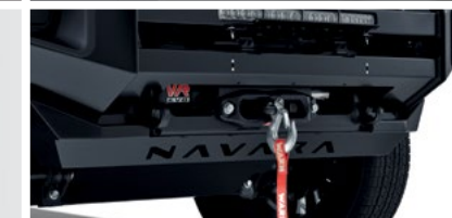
Winch & Winch Fitting Kit