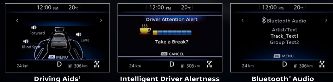
Driving Aids †

It's easy to be in control of the situation with the Navara's Advanced Drive-Assist Display. Helping keep your eyes on the road with less looking away means you're focused and relaxed whether you're dodging boulders or navigating city traffic. The Navara's 7-inch Advanced Drive-Assist Display puts key information right where you want it. With a quick look down, you can get info on everything including music information and key driver's aid alerts. The inbuilt Intelligent Driver Alert system can even monitor your driving and suggest when you may need to take a break or stop for coffee.