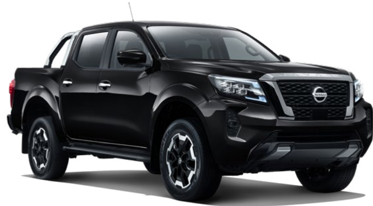
Black Star †