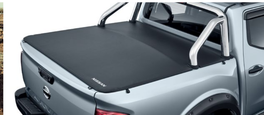
Soft Tonneau Cover