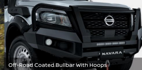
Off-Road Coated Bullbar With Hoops

NISSAN GENUINE ACCESSORIES Complete Confidence