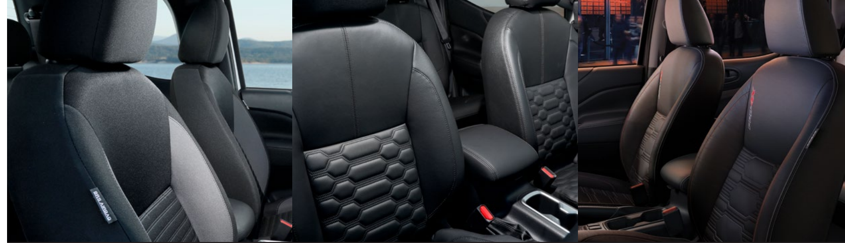
CLOTH SEAT TRIM - SL & ST GRADES