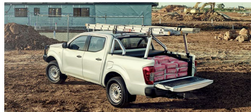
Ladder Racks (Front & Rear)

Nissan Genuine Accessories keep your vehicle complete and help maintain its resale value.