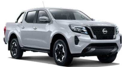
Brilliant Silver ‡