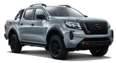
Stealth Grey ‡