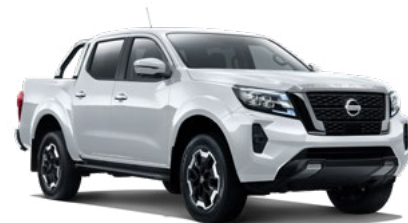
Solid White ‡