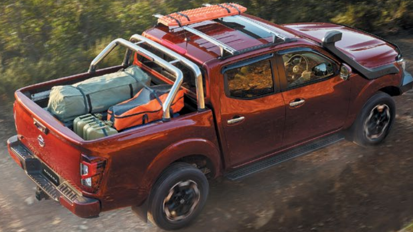
Navara Dual Cab

NISSAN GENUINE ACCESSORIES Complete Confidence