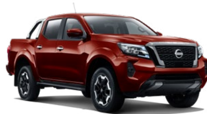
Forged Copper ‡