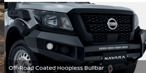
Off-Road Coated Hoopless Bullbar